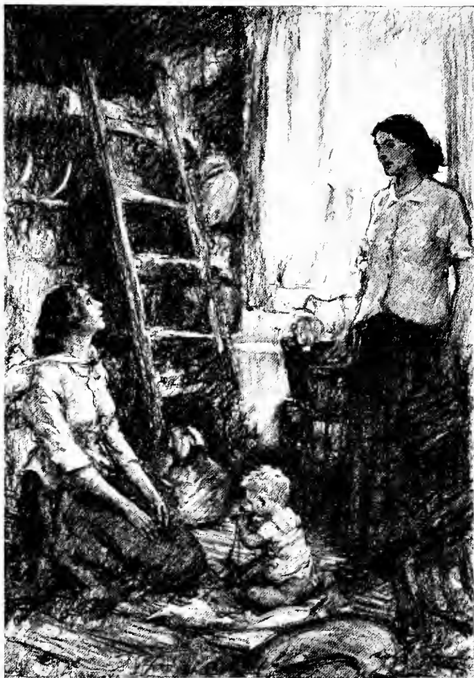
Nancy stood staring at her, with words beyond saying in her heart—words that rose in her throat and choked her