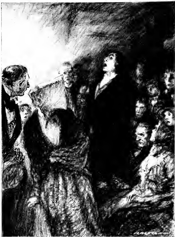
He was now towering over those near him, with his head thrown back, and his hair tossed like a mane on his shoulders