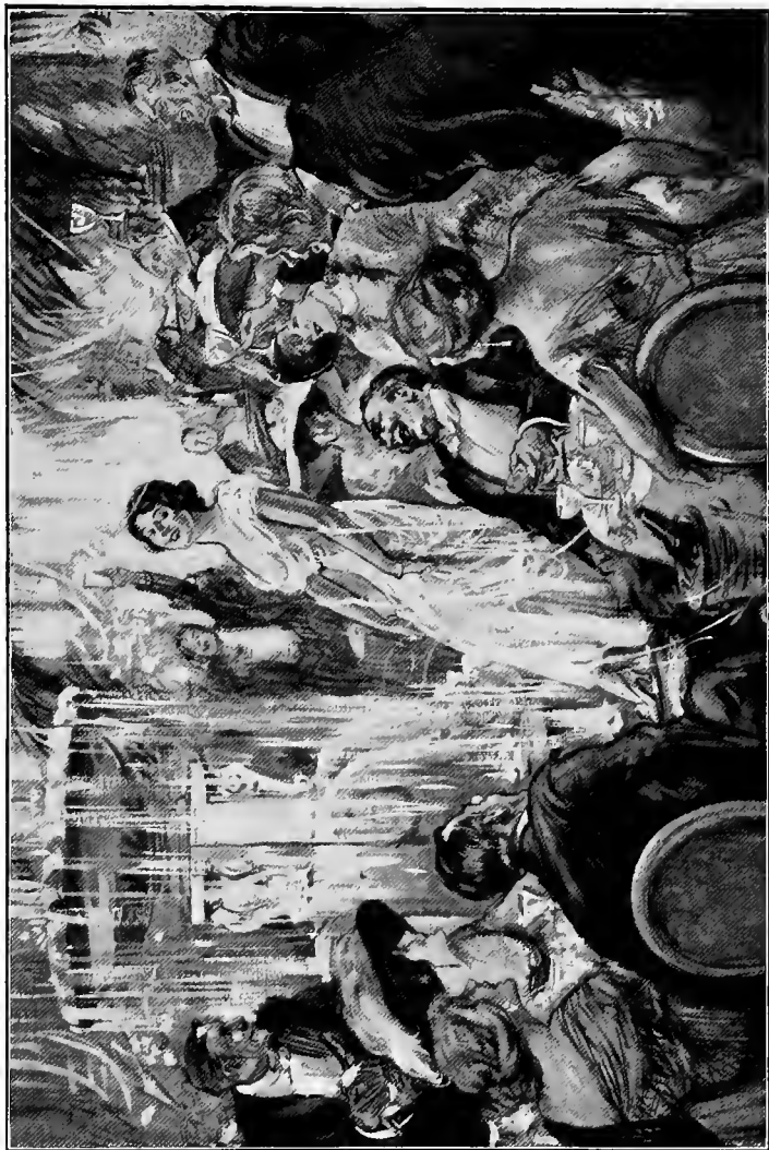
“SLOWLY AND GRACEFULLY HAD WADED INTO ITS CHILLING MIDST”