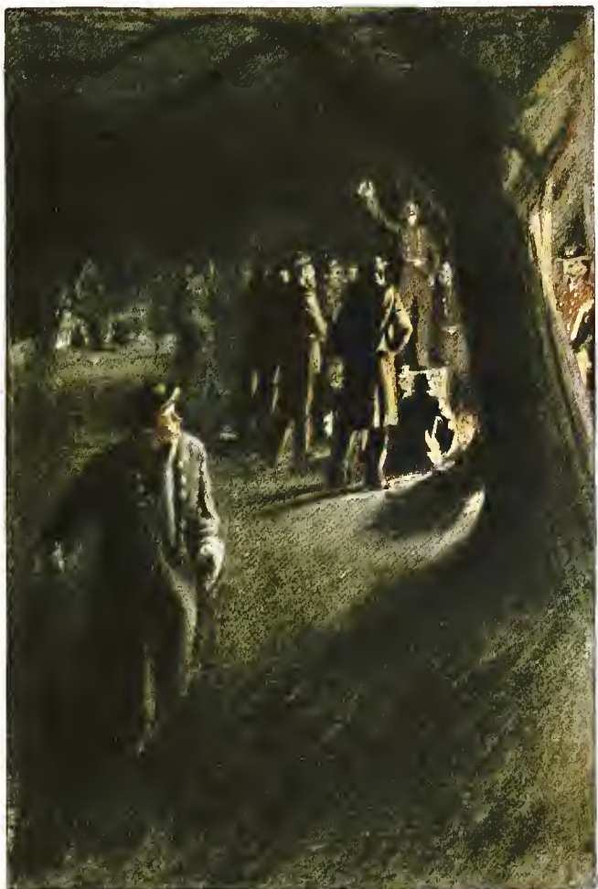
Bob trotted around, keeping as far away from the light of the camp-fires as possible.