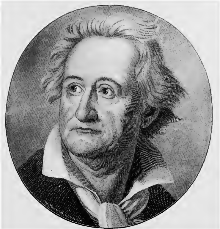
GOETHE BY KOLBE (From Heinemann's Goethe )