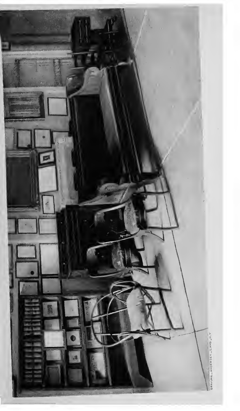
GRAVURE - ANDERSEN - LAMB - N.Y.