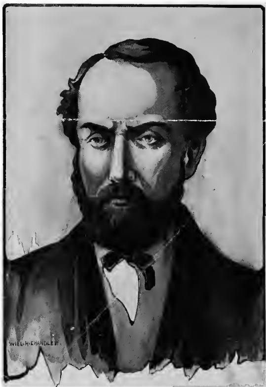
MAJ. HENRY WIRZ.