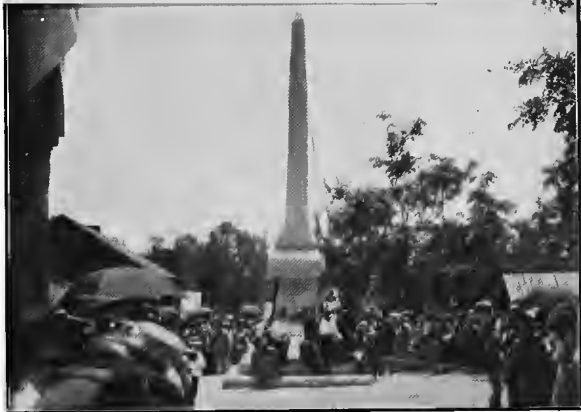
Confederate Veteran January 1910 MONUMENT TO MAJ. HENRY WIRZ, ANDERSONVILLE, GA.