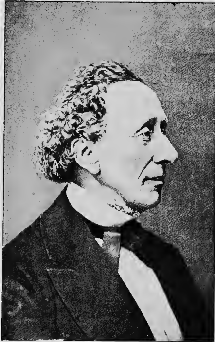
HANS CHRISTIAN ANDERSEN.