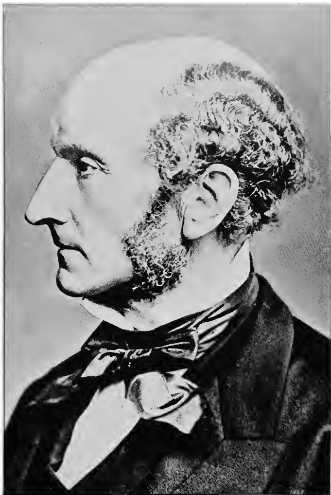
JOHN STUART MILL.