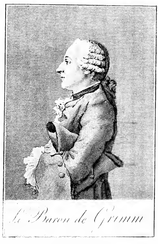
FRÉDÉRIC-MELCHIOR GRIMM. From an Engraving, after Carmontelle, in the Bibliothèque Nationale, Paris.