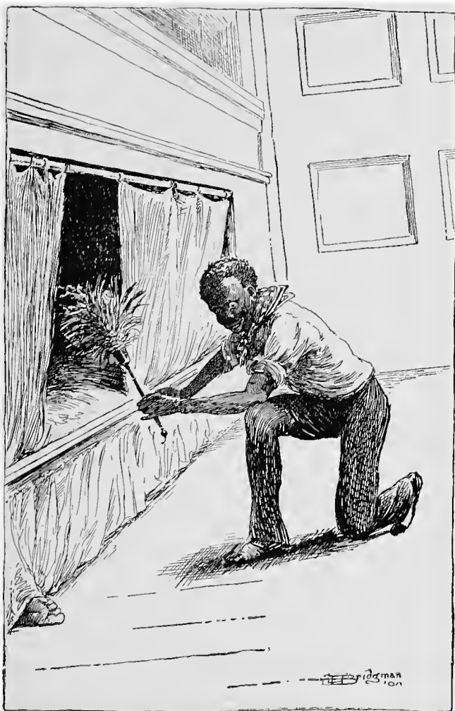
DAVE FINDS MULGRUM UNDER THE BERTH.