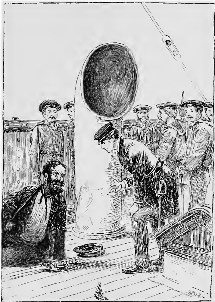
THE CAPTAIN OF THE ARRAN.