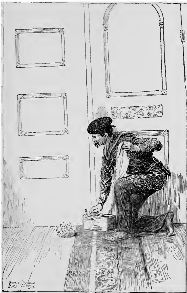
MULGRUM AT THE CAPTAIN'S DOOR.