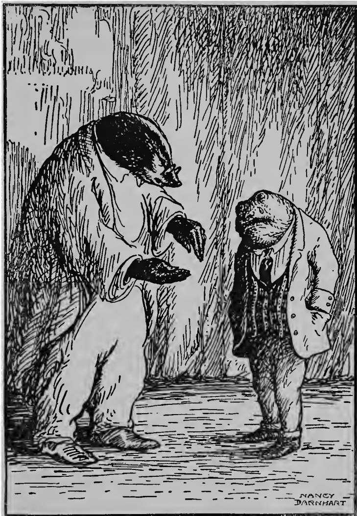
LONG-DRAWN SOBS FROM THE BOSOM OF TOAD