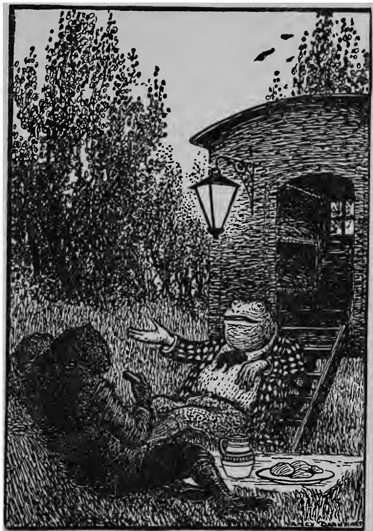
TIRED AND HAPPY AND MILES FROM HOME