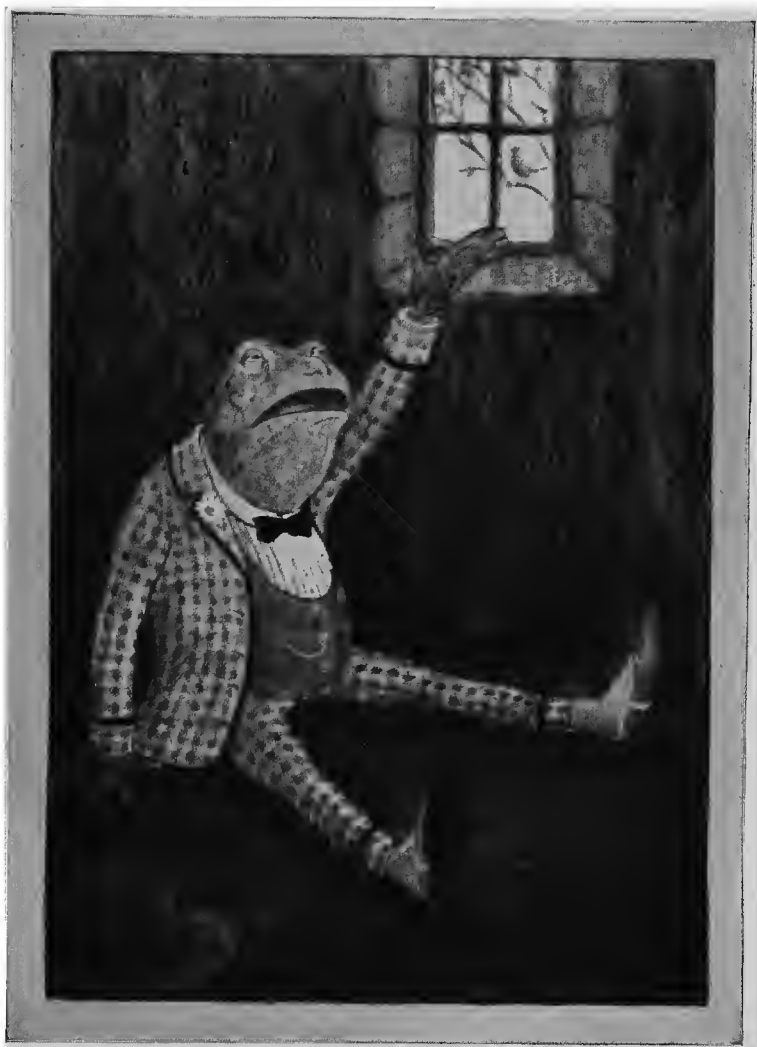
O UNHAPPY AND FORSAKEN TOAD