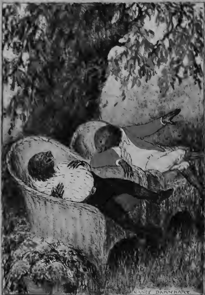
OUT ON THE LAWN, ROARING WITH LAUGHTER