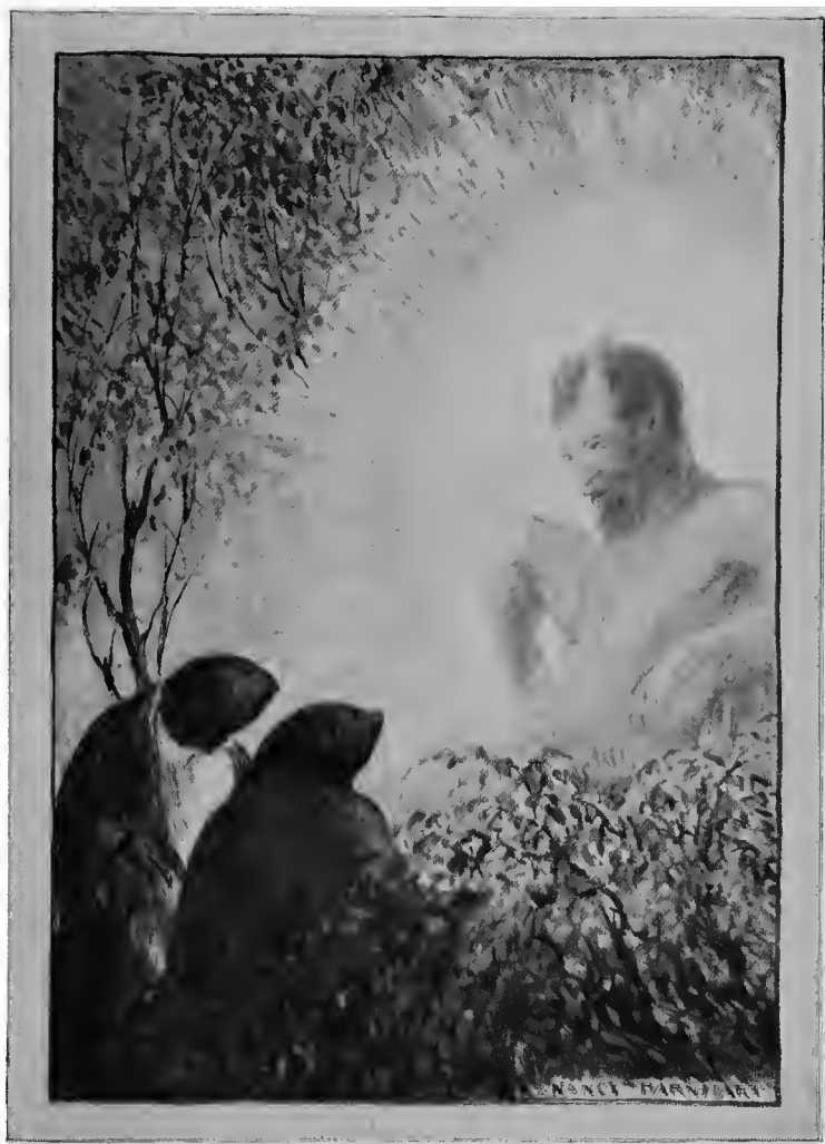
LOOKED IN THE VERY EYES OF THE FRIEND AND HELPER