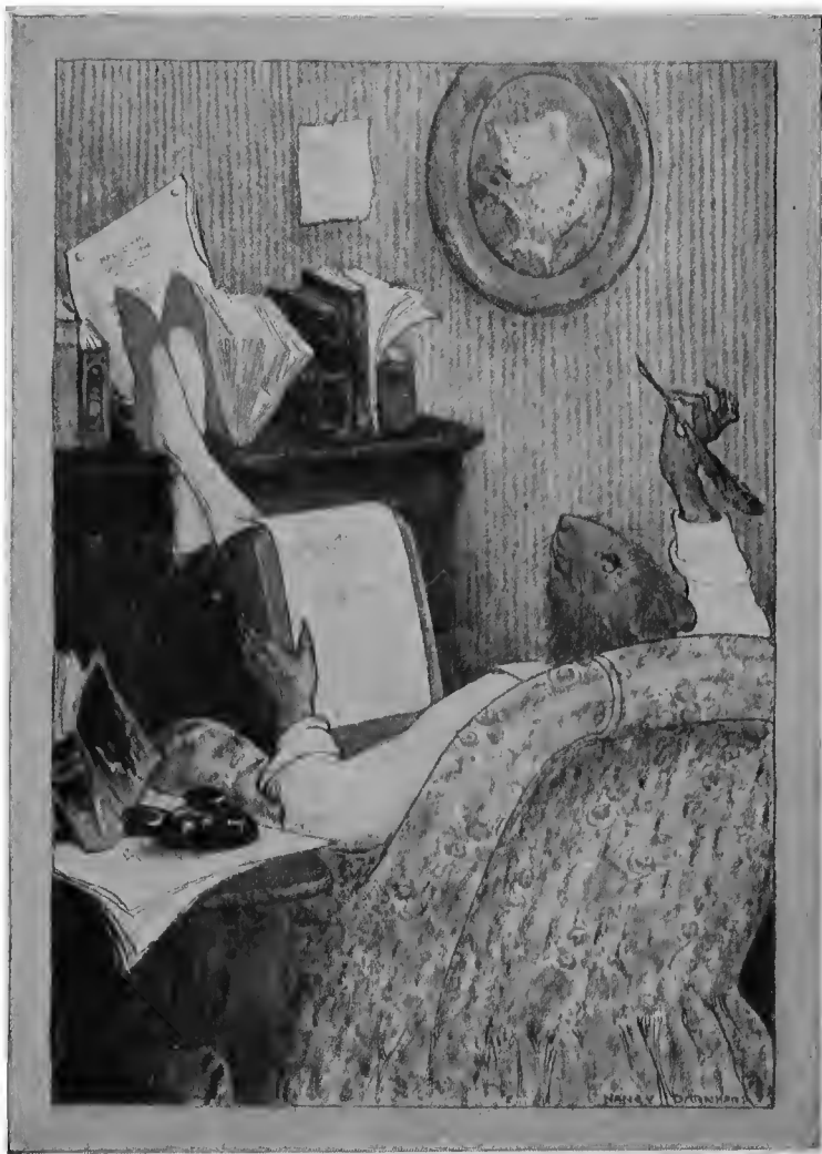
HE SOMETIMES SCRIBBLED POETRY