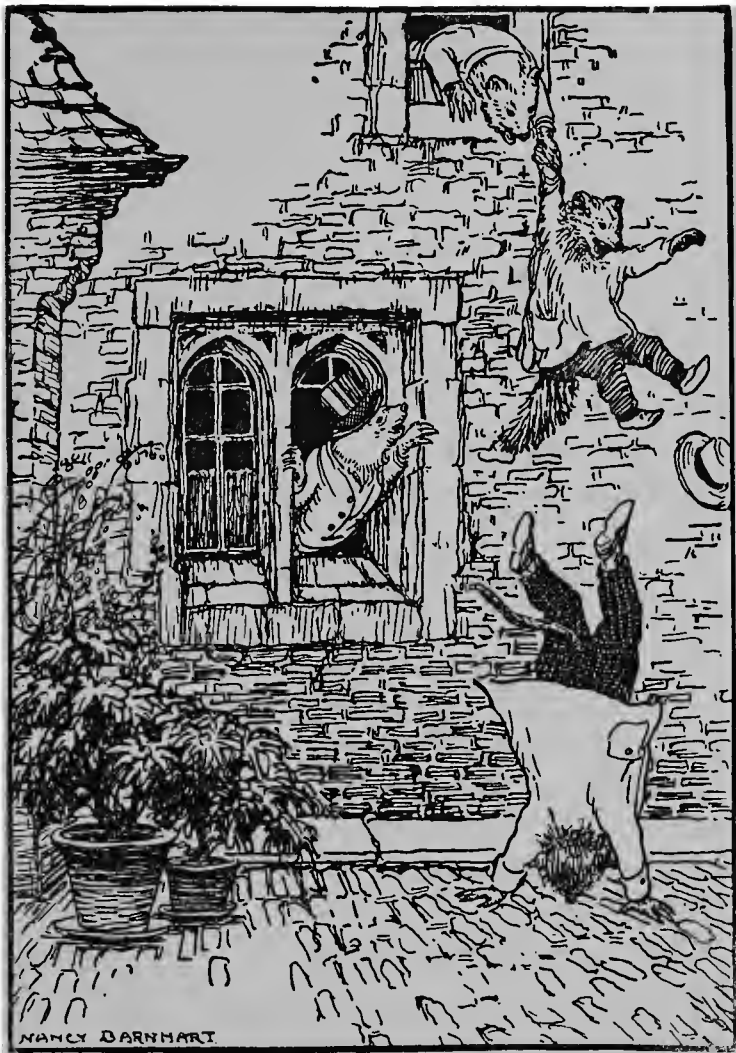
THE WILD WOODERS HAVE BEEN LIVING IN TOAD HALL