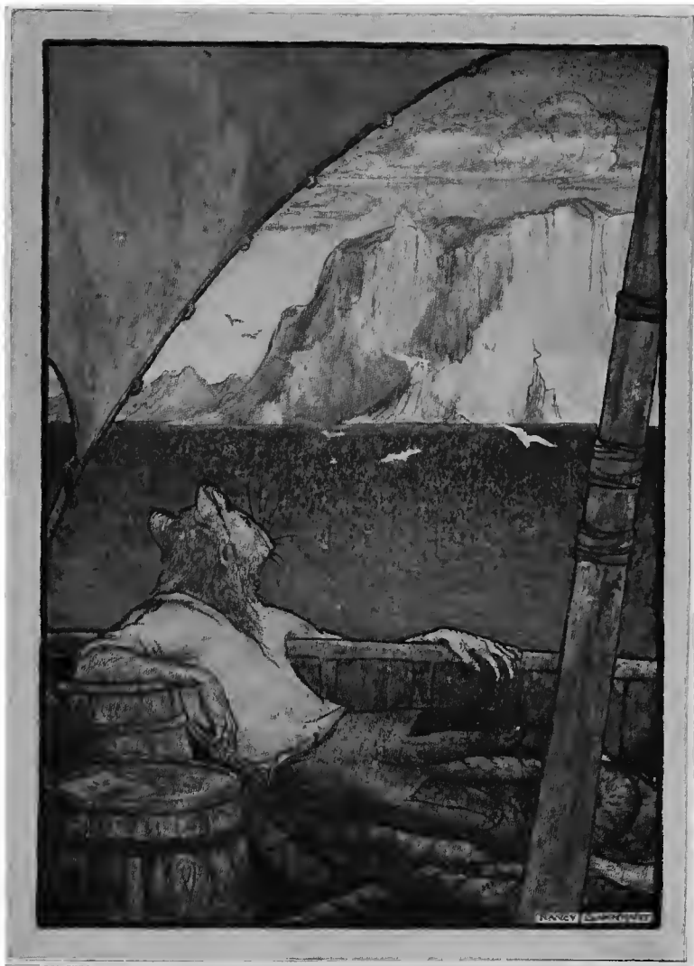
THOSE WERE GOLDEN DAYS