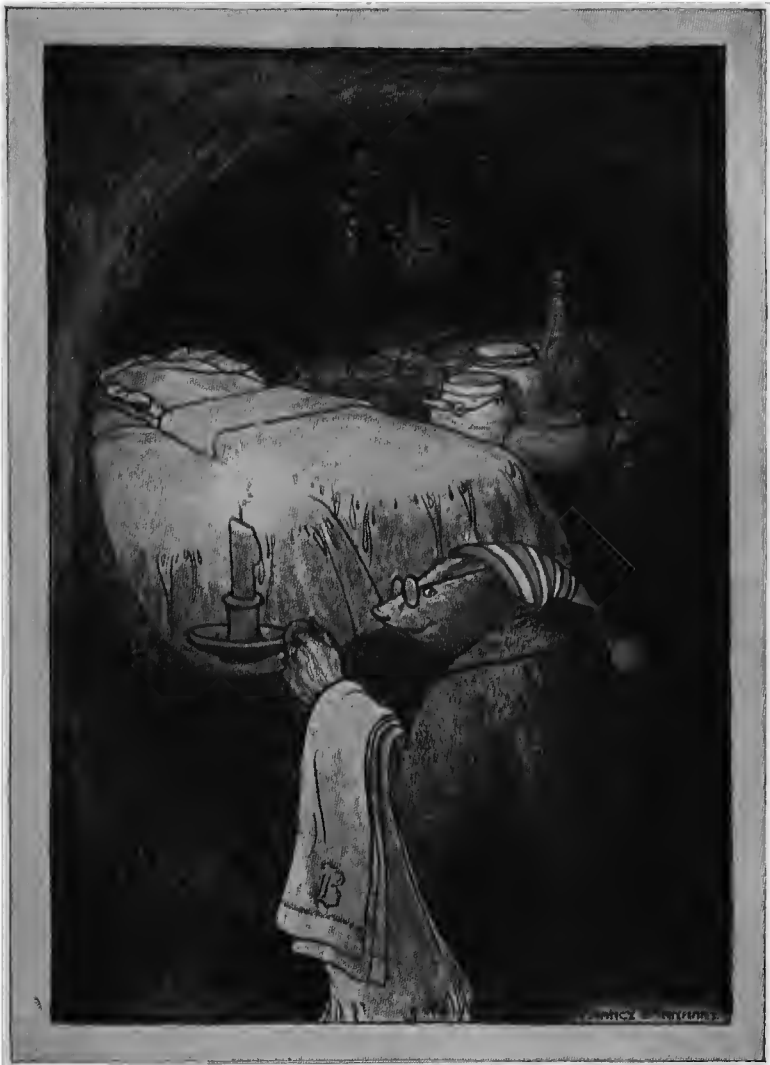
THE TWO LITTLE WHITE BEDS LOOKED SOFT AND INVITING