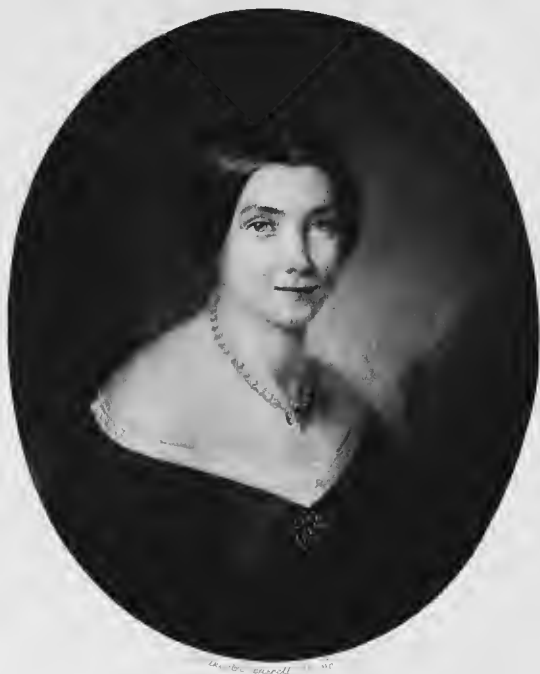
Baroness Bonde Circa 1850.