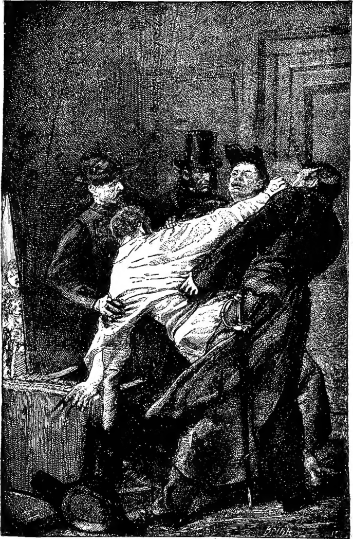
The kidnaping of Quaestor Baze.—Page 27.