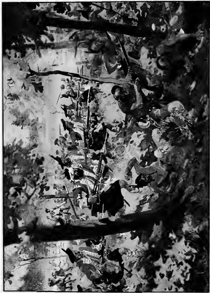
THE BLACK WATCH AT BUSHY RUN, 1763