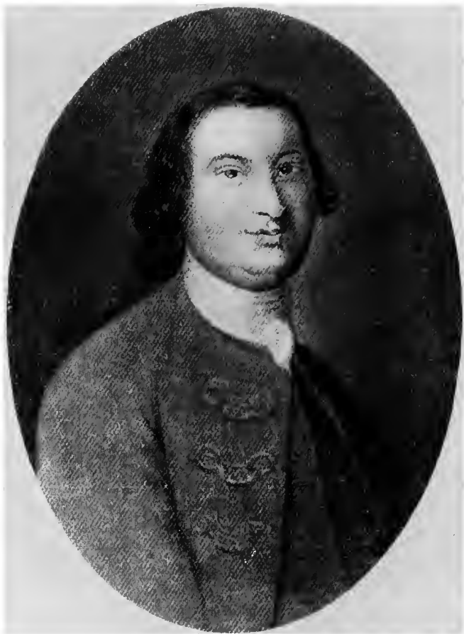
COLONEL HENRY BOUQUET