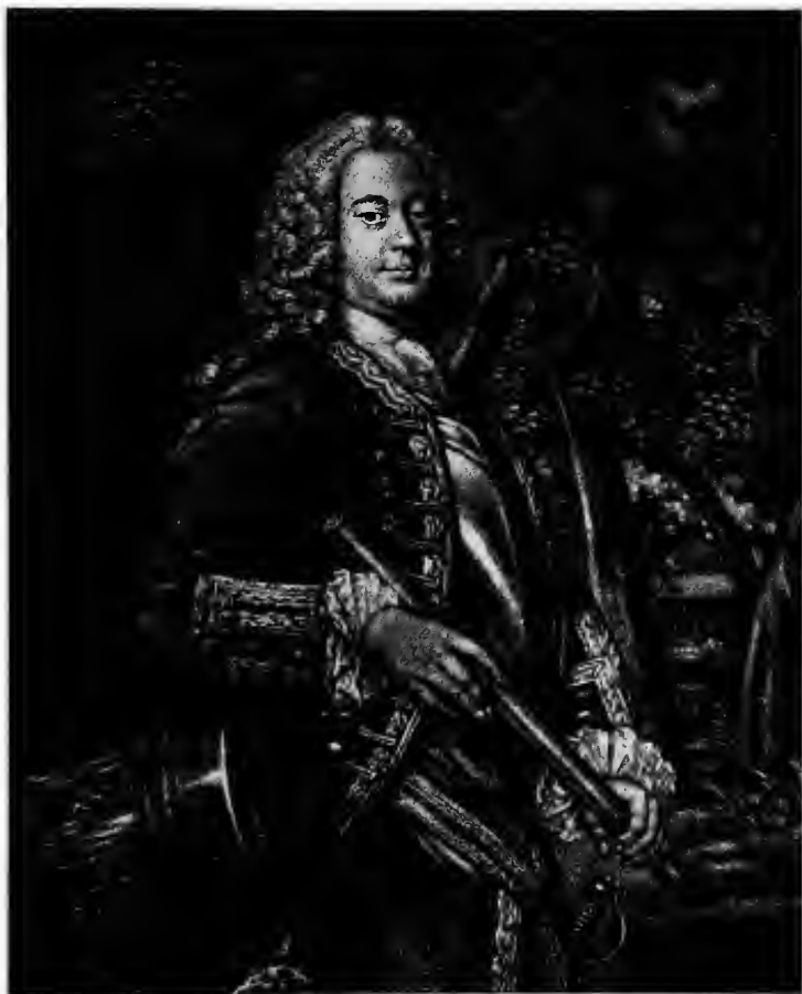
SIR WILLIAM JOHNSON