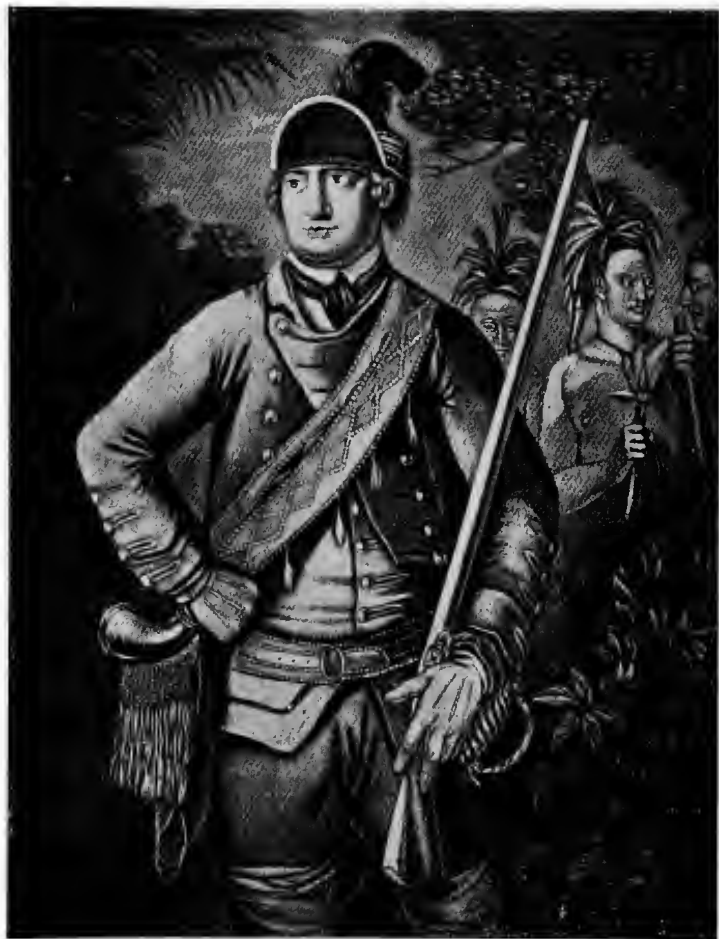
MAJOR ROBERT ROGERS

From an engraving in the John Ross Robertson Collection, Toronto Public Library