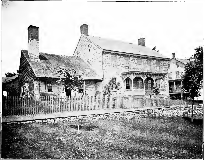
Shafer Homestead, Stillwater.