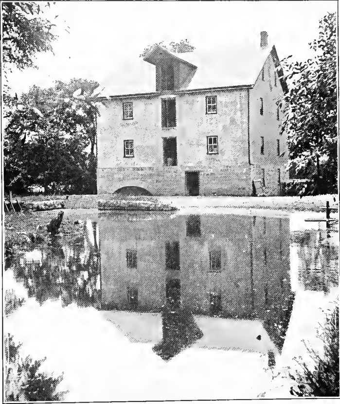
Stone Mill, erected 1844.