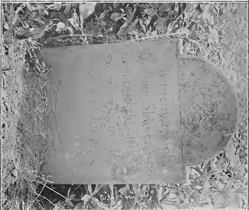
Tombstones in Old Cemetery, Stillwater.