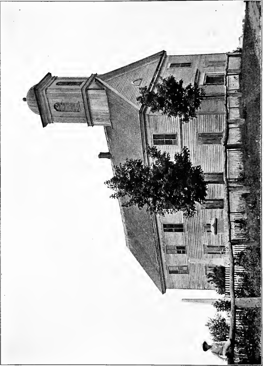
Yellow Frame Church.