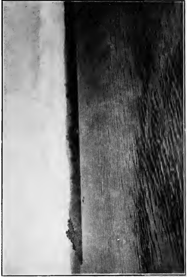
PALMER'S ISLAND, SUSQUEHANNA RIVER