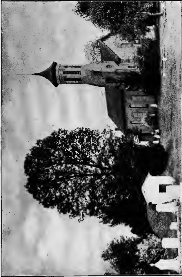
SPESUTIA CHURCH. PERRYMANS