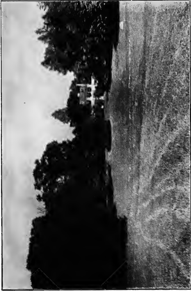
"THE HOMESTEAD," NEAR BEL AIR, BUILT BY WILLIAM SMITHSON, 1774