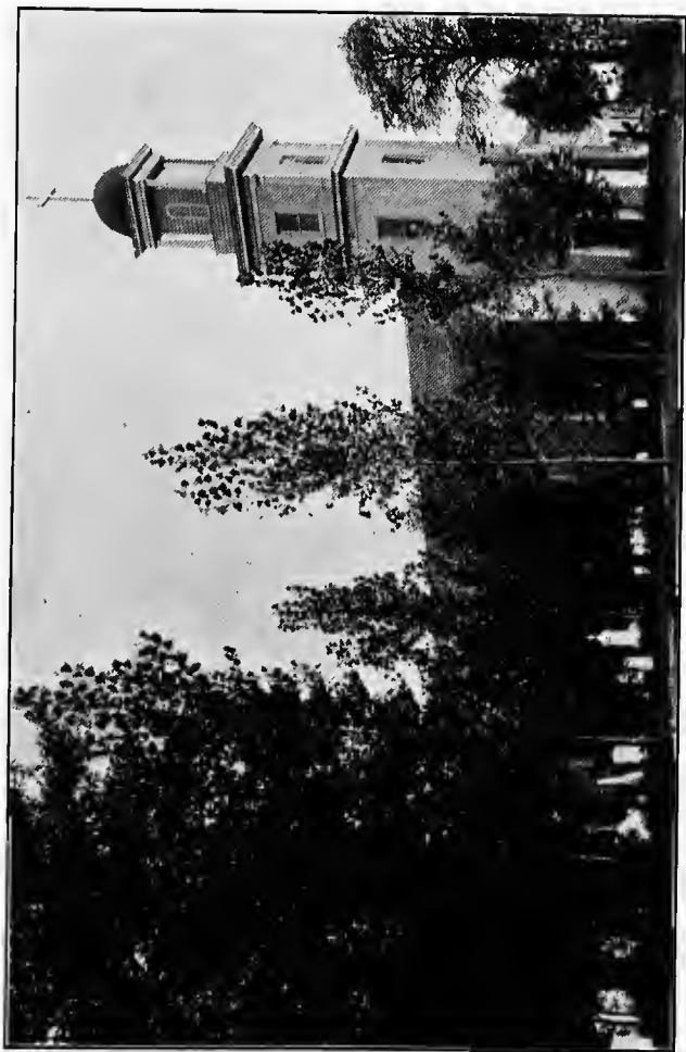
ST. IGNATIUS CHURCH, HICKORY