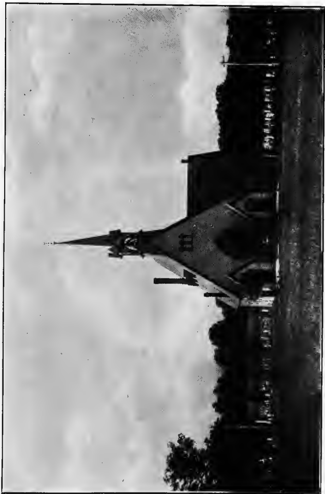
BETHEL CHURCH, NEAR JARRETTSVILLE