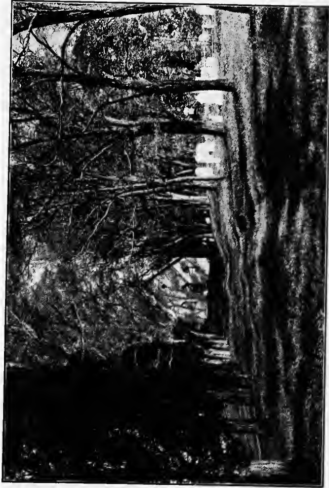
THE SITE OF COKESBURY COLLEGE, ABINGDON