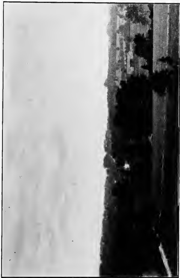
SITE OF HARFORD TOWN OR BUSH