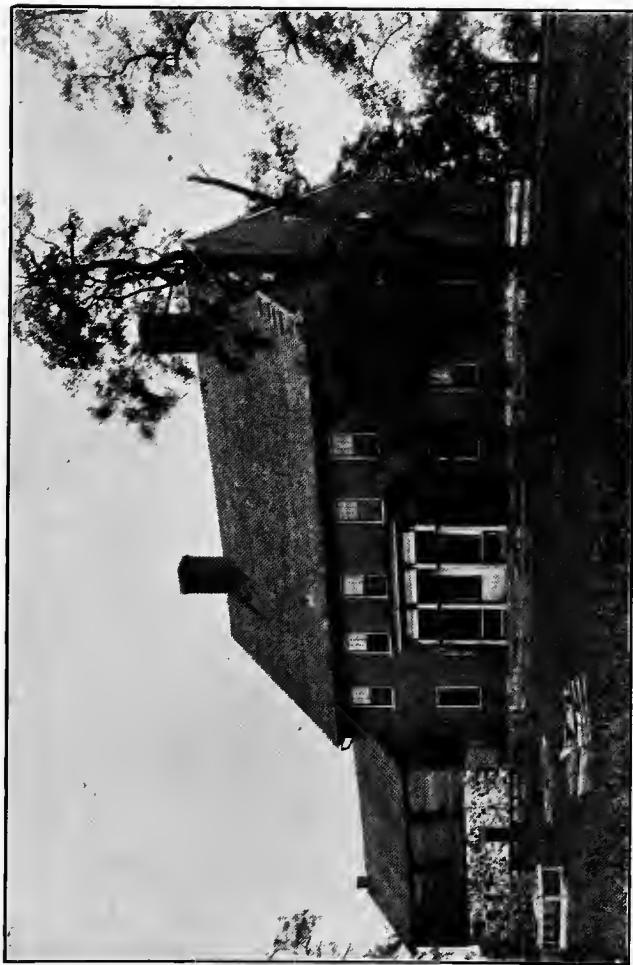
THE DAIRY FARM HOUSE, BUILT BY AQUILA HALL, 1768