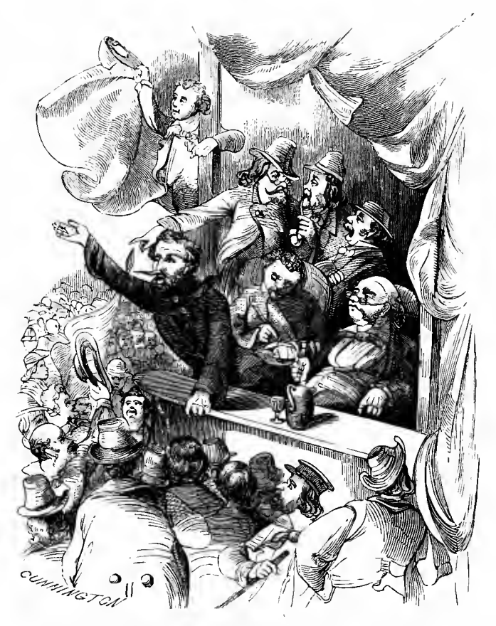
THE GREAT MEETING OF FOREIGNERS IN THE PARK .- Page 197.