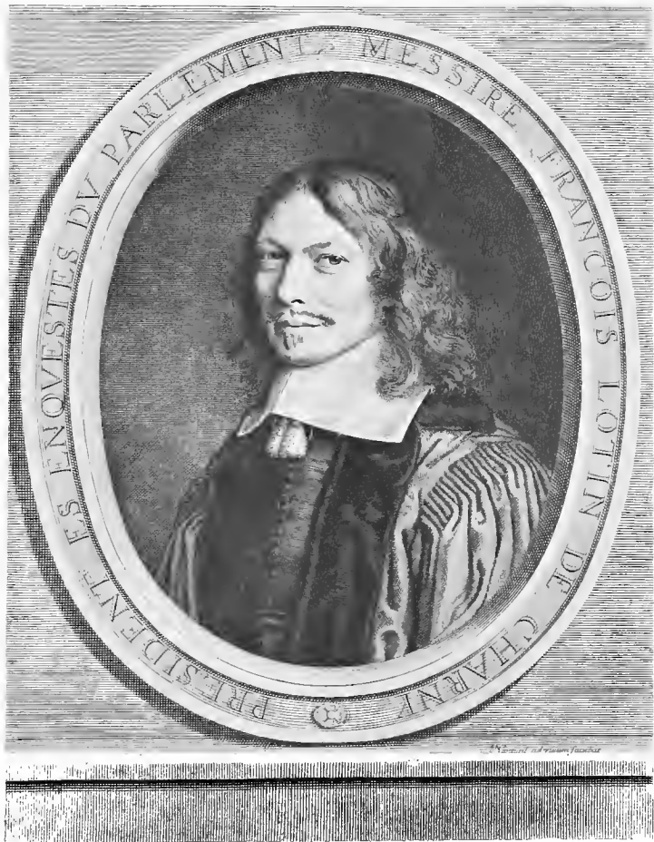
Reduced Facsimile, Lot 609