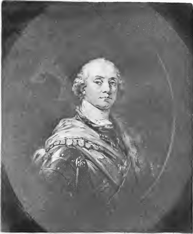
Le Prince de Nysbau Siegen à Paris et à Metz par Schœ & Artaud Comp.