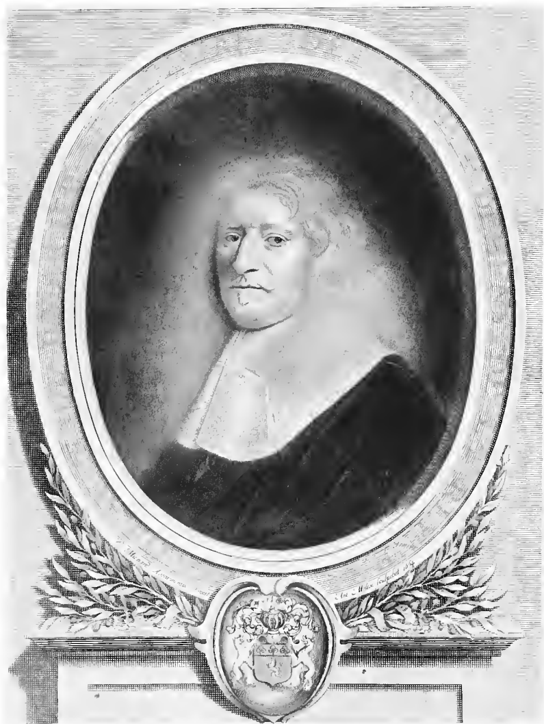
Reduced Facsimile, Lot 549