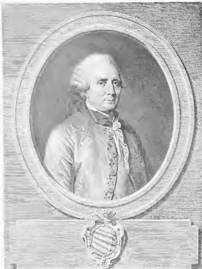
Reduced Facsimile, Lot 87