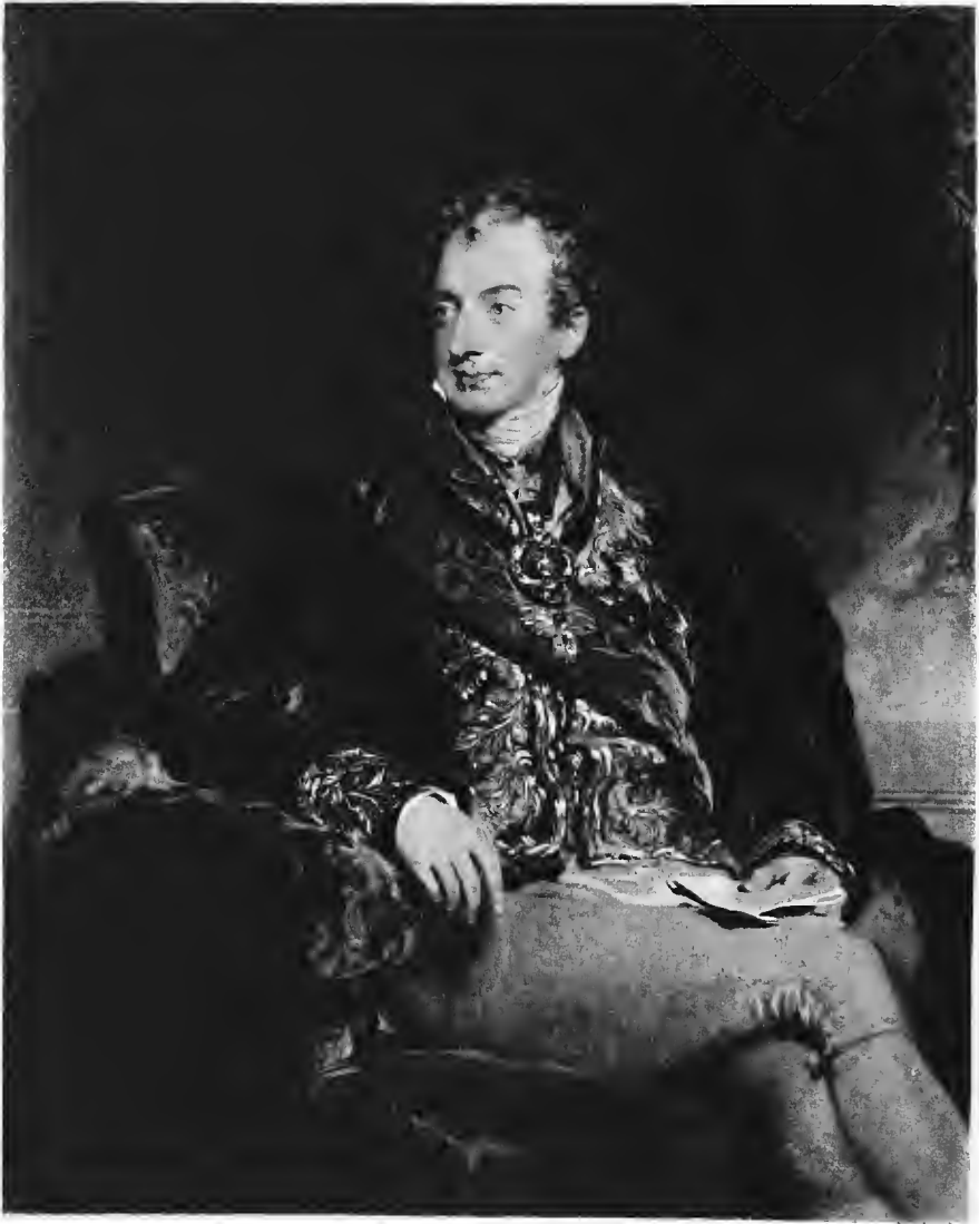
Reduced Facsimile, Lot 199