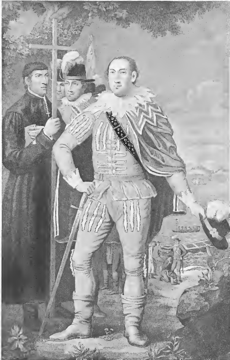
The Landing of Christopher Columbus On the morning of October 12 th 1492, COLUMBUS RICHLY DRESSED, with a sword in his hand, first set his foot on the NEW WORLD, which HE had discovered. The Portrait of COLUMBUS is Copied from The Original Picture in the Collection of The GRAND DUKE of TUSCANY at FLORENCE. Painted & Engraved by G. de S. 1492.