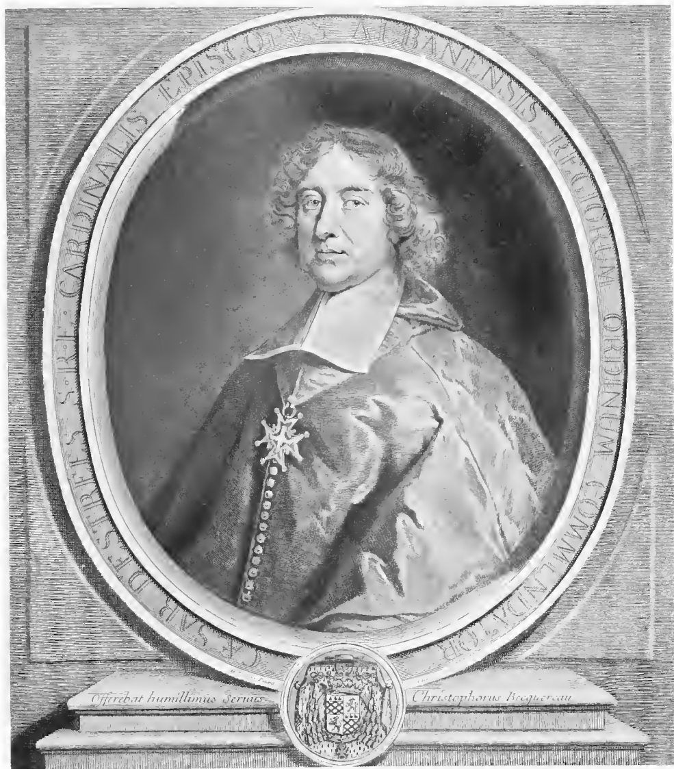
Reduced Facsimile, Lot 265