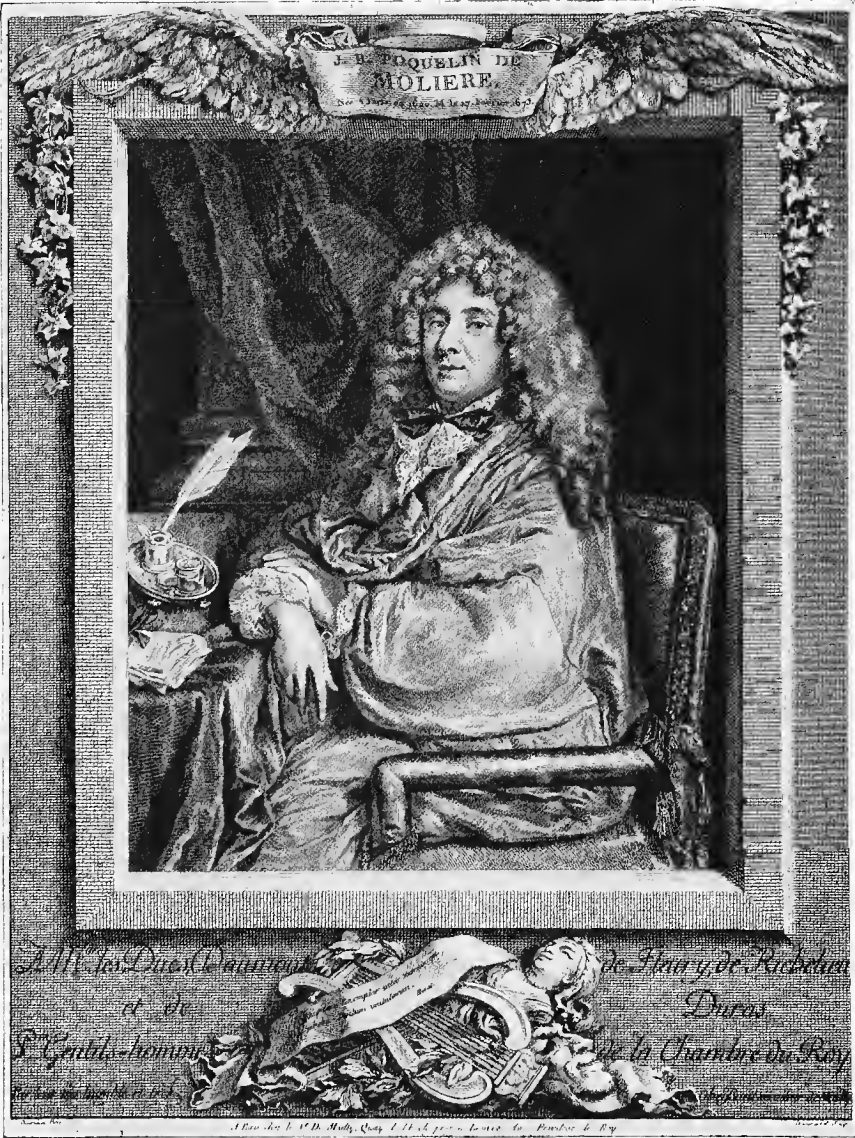
Reduced Facsimile, Lot 69