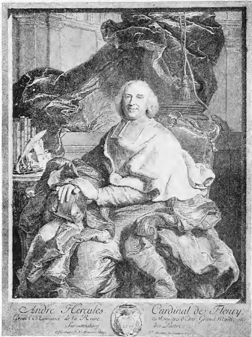
Reduced Facsimile, Lot 249