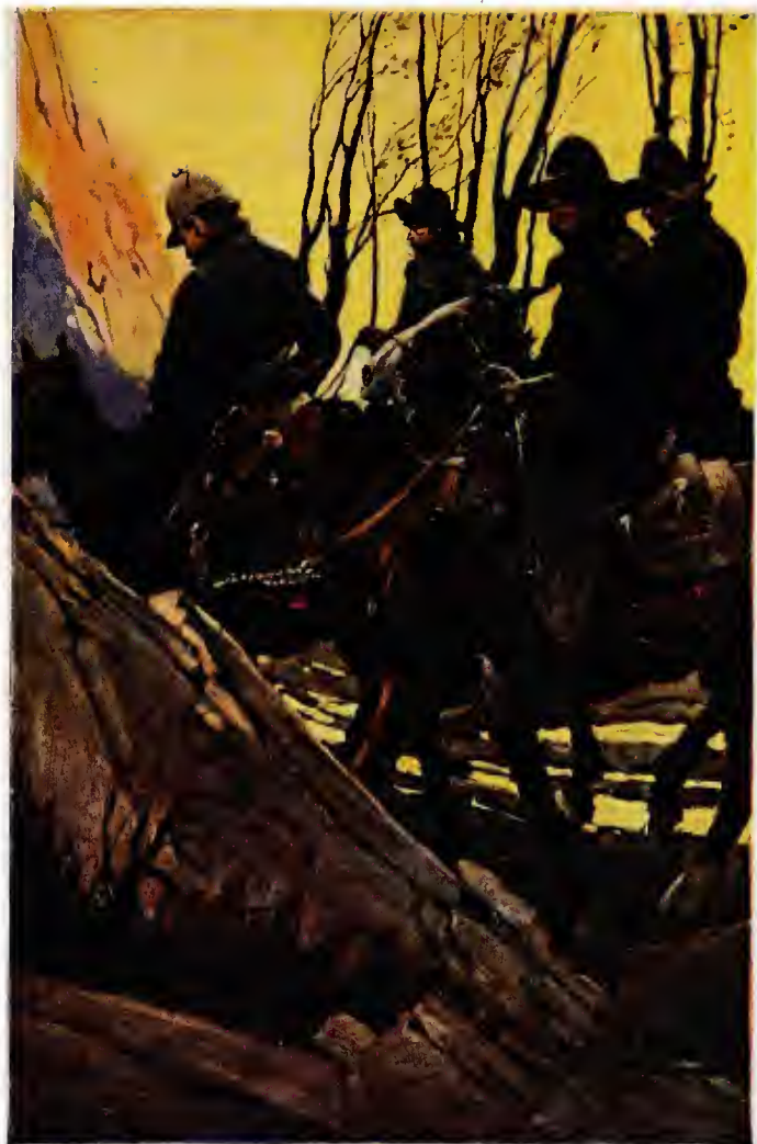
'These three carried rifles slung across their pommels, and in front of them rode the stranger.