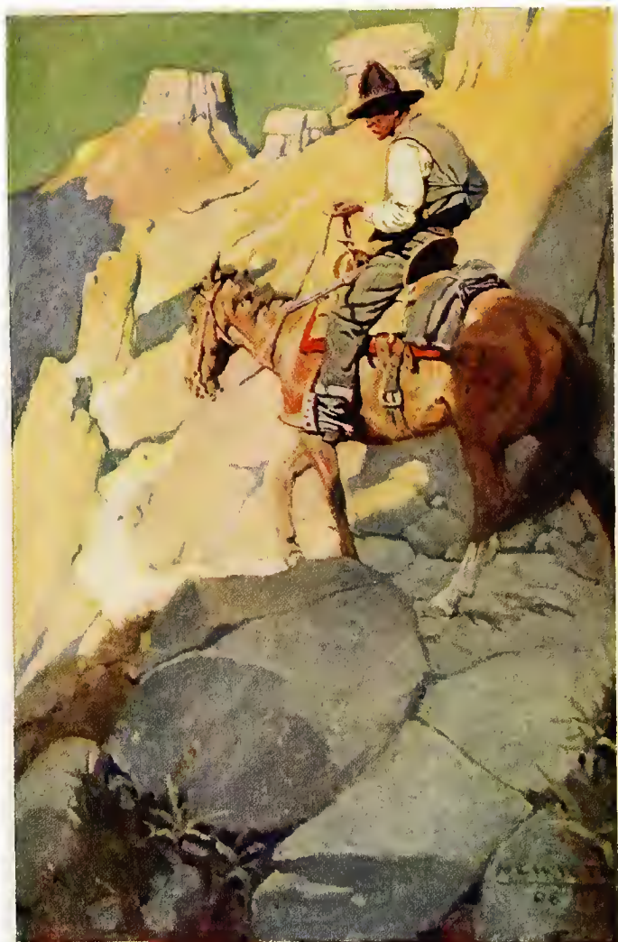
Following the trail itself, Whispering Smith rode slowly.