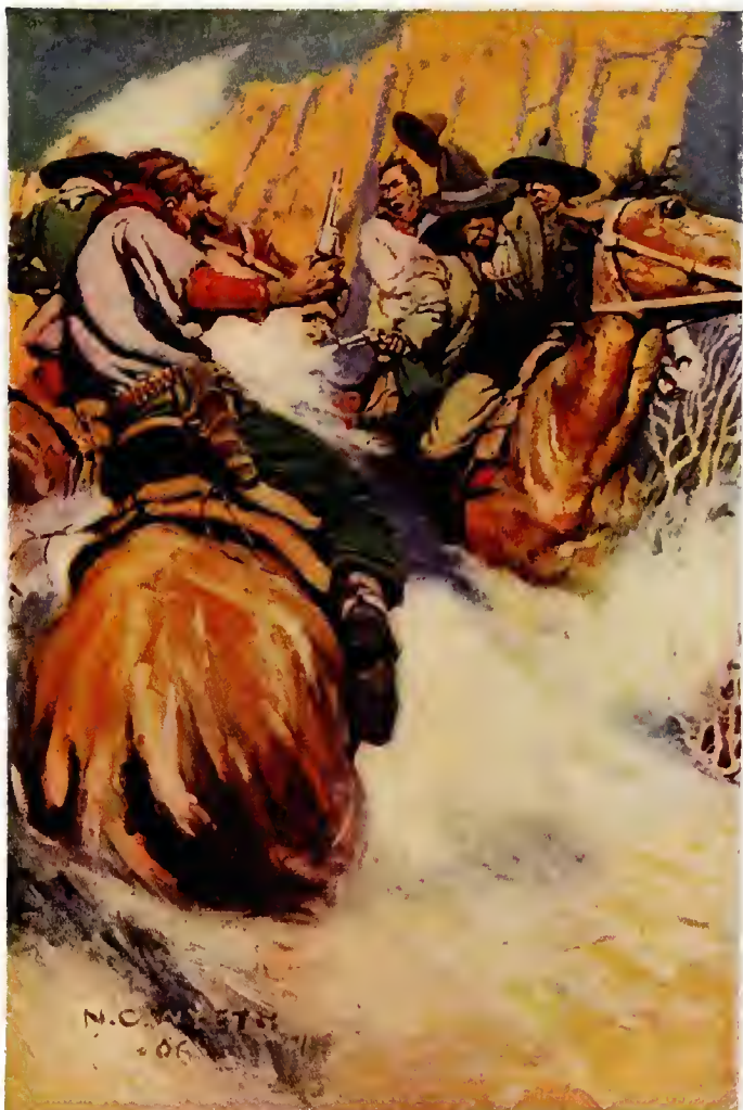
Wheeling at arm's length, shot again.