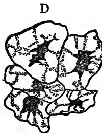
Nerve cells from same region (as in C) of an aged honey bee.

Showing changes in nerve cells due to age.