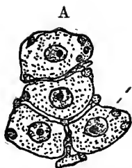
Spinal ganglion cells of a still-born male child. N , nuclei.