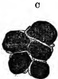
Nerve cell from the antennary ganglion of a honey bee, just emerged in the perfect form.