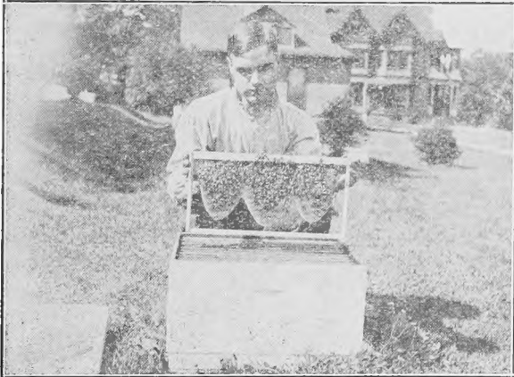
Fig. 2. Seven Days Later. Foundation Drawn Out and Filled with Eggs and Larvae