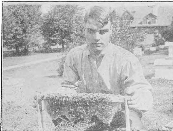
Fig. 3. Comb with Eggs Cut Away from Edges