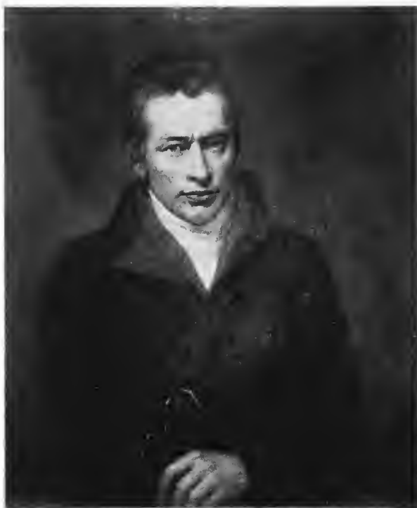
Thomas Holcroft. From the painting by John Opie, R.A. in the National Portrait Gallery.