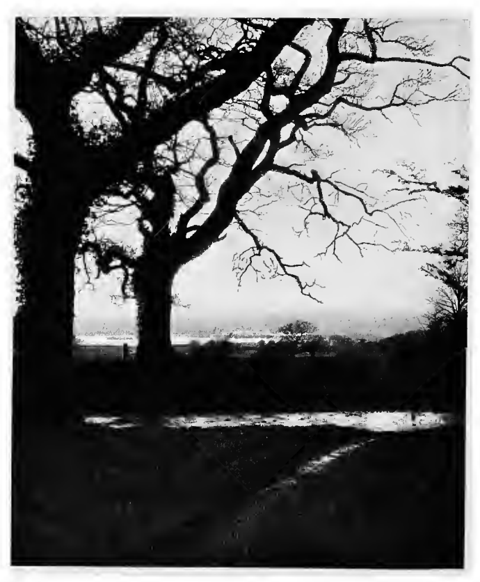
The Estuary from Holly Hill: