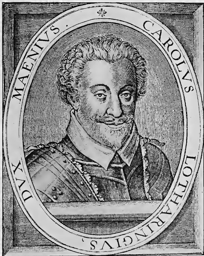
DUKE OF MAYENNE