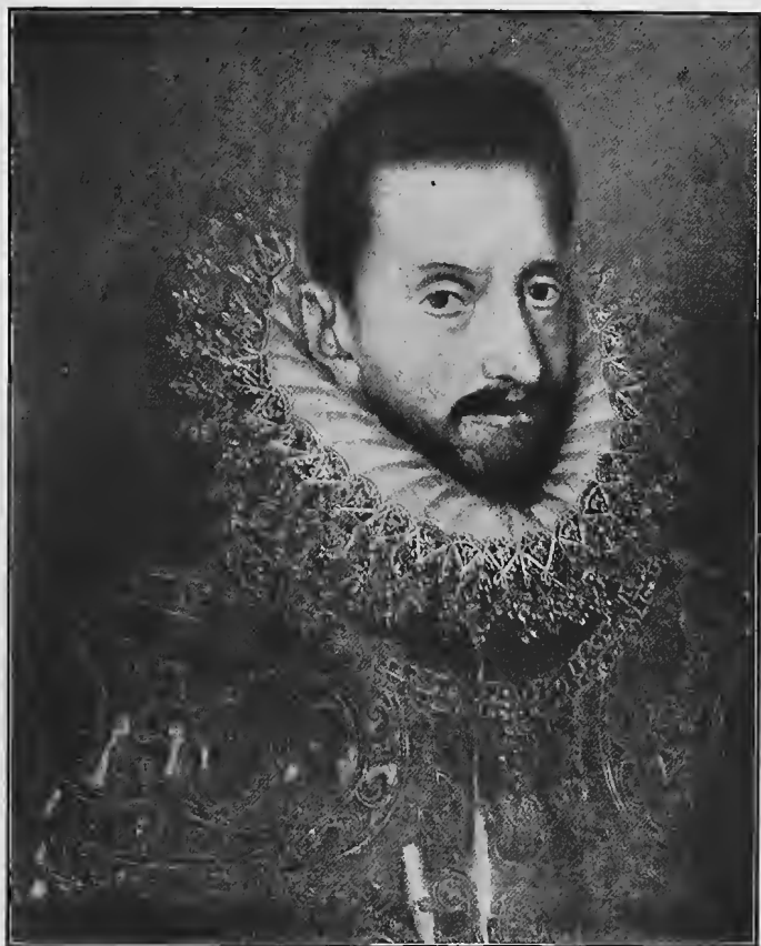
ALEXANDER FARNESE, DUKE OF PARMA Gallery of Versailles, France.