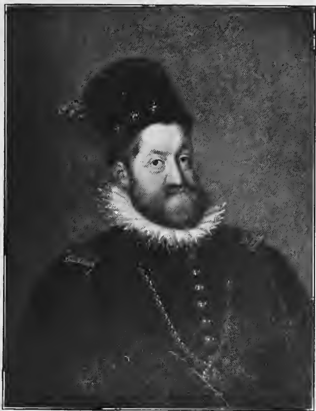
EMPEROR RUDOLPH II. After the painting by J. Heinz.