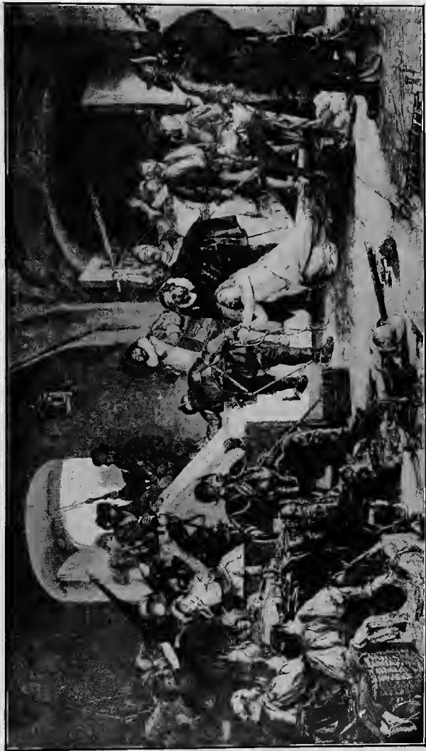
THE SPANISH FURY IN ANTWERP, NOVEMBER 4, 1576