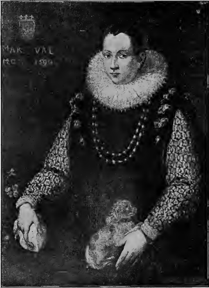
MARGARET DE VALOIS, QUEEN OF NAVARRE. Painting by François Clouet, called Janet; Chantilly.