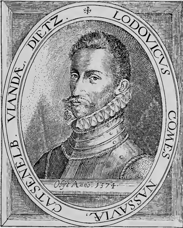
LOUIS OF NASSAU. After a contemporaneous engraving.