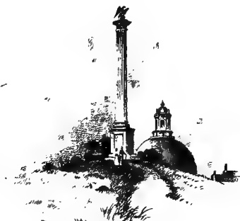
The Summit of Beacon Hill, 1803

PUBLISHED BY Small, Maynard & Company BOSTON