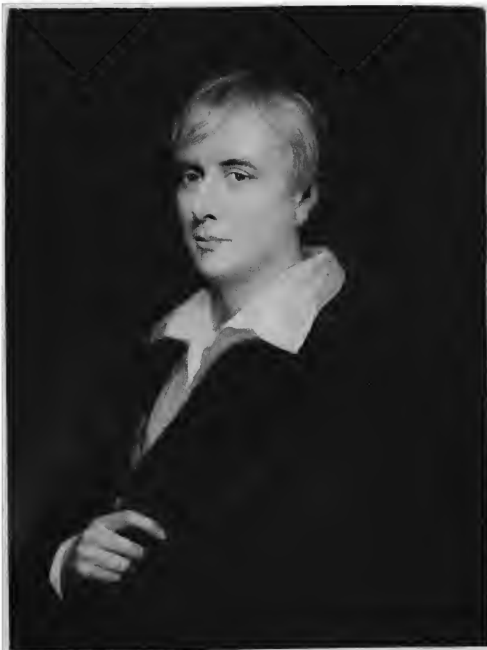
Thomas Phillips, R.A. pinx