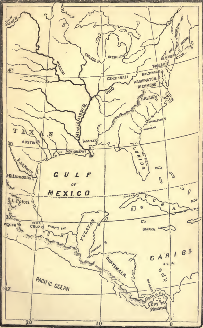
Map; showing the relative situation of Cuba, and other West India Islands, and different parts of the United States.