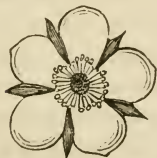
Staminate or Male Blossom.