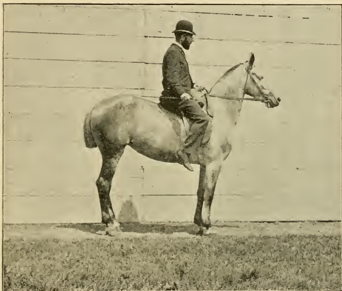
CARRYING THE HIND LEGS UNDER THE BODY.

the rear. The rider will always carry back the head to the position straight with the body by means of the reins, not permitting the horse to volunteer this. In the same manner, and with