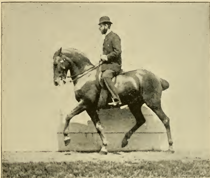
IN HAND IN THE TROT.

croup and meet these with the hand until the cadence of the pace becomes regular, and the animal moves with its head held perpendicularly to the plane of movement, its neck curved,