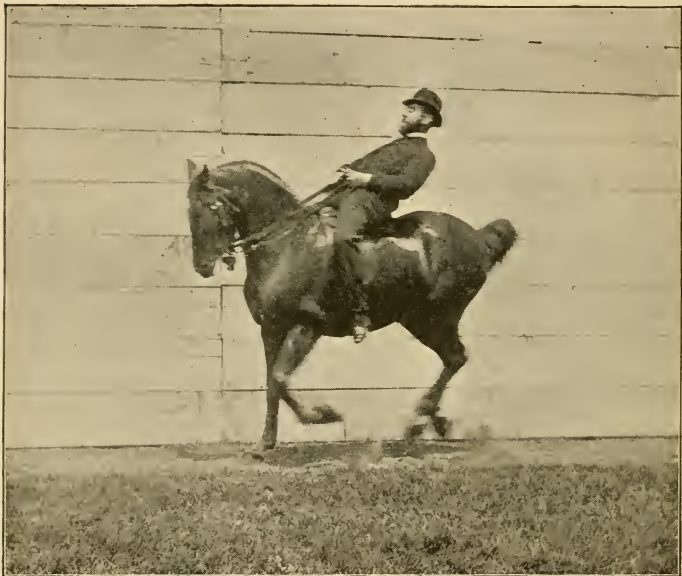
HALT FROM THE GALLOP.

bridle-hand, so that the horse will come to a stop with the hind legs well under the mass. At the moment the halt is effected the hand should release the tension upon the reins, and the heels