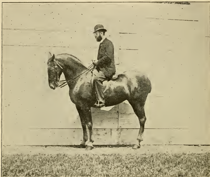
IN HAND IN PLACE.

is a level gait in which the strong and regular impulses assist the aids in uniting the horse. But the rider should be able to bring the horse "in hand in place" after one or two lessons in