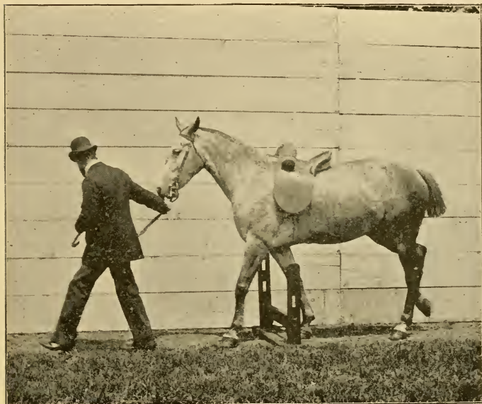
LEADING OVER THE BAR.

During the lessons upon the longe, the horse should be exercised near the gates and hurdles so that it may become accustomed to them. When the horse is ready for its lessons in jumping,