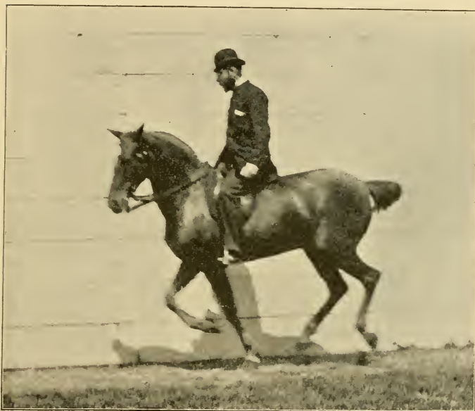
UNION WITHOUT REINS. GALLOP.

able to depend upon his horse maintaining the speed, action, and union, of the moment in which the tension upon the reins is released. It is also excellent discipline, on general principles, to ac-