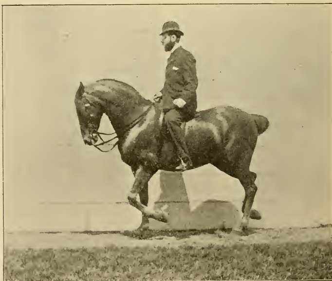
UNION WITHOUT REINS.

WITH every horseman there may be occasions when it will be important that his bridle-hand should be free, and that he should be