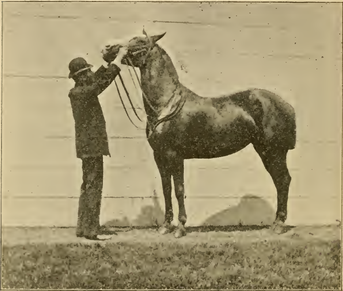
ELEVATION OF HEAD.

trainer should induce the horse to submit to be driven with the stirrups let out to the full length of the leathers, and dangling against the sides, and to bear the flapping of cloths over