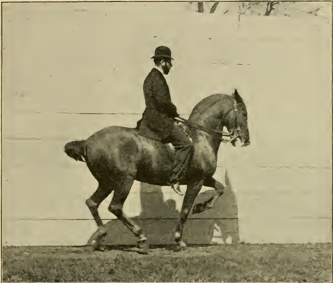
BREAK INTO GALLOP FROM SLOW TROT.

hand, or so slow and languid that the animal will be disposed to resume the trot. The upward play of the direct rein should not be too marked, and it must be supported by the opposite