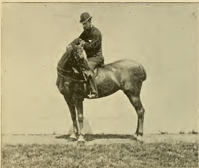
BENDING THE HEAD, MOUNTED.

To make the horse lower the head, the rider should take a light feeling upon the mouth, with his legs closed against the flanks; the hand should then be held low and a steady tension