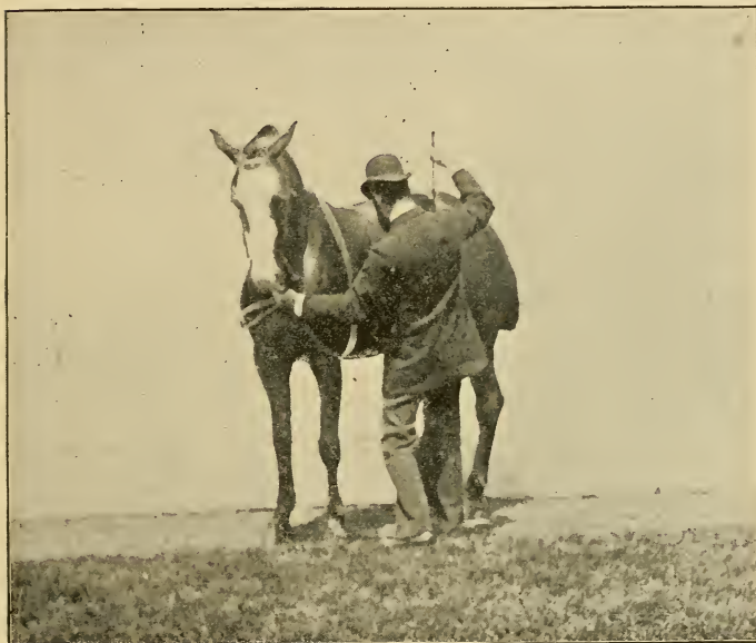
CARRYING THE CROUP ABOUT THE FOREHAND.

high as it should be carried when the horse is straight, and in motion under the rider. The young horse must have sufficient exercise, or the trainer will not be able to direct and keep its