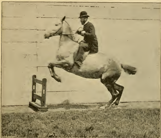
THE FIRST LEAP OF A YOUNG HORSE.

impede the horse in its efforts to land safely, and yet if the horse seeks some support it must find it. Should the horse ever refuse a leap, or get into the habit of jumping carelessly, it should be