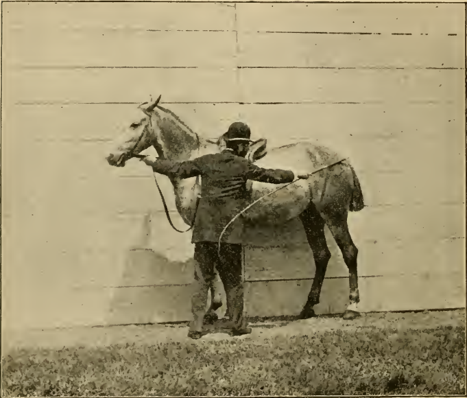
RUBBING THE COLT WITH THE WHIP.

been taught to enjoy caresses, the rider should frequently pat and handle the animal while holding the short whip in his hand. Gradually he should habituate the horse to bear the whip