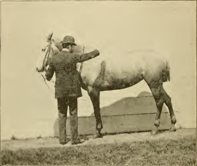
CARRYING THE HIND LEGS UNDER THE BODY.

taps upon the rump, holding the forehand in place. To bring the horse into a natural position, the hind legs should not be permitted to move to the rear, but the trainer should induce the horse