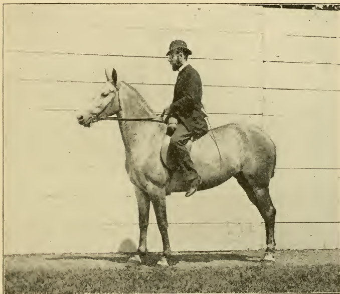
APPLYING WHIP TO THE NEAR FLANK.

The pirouette reversed to the left should be made in the same way, right and left aids being