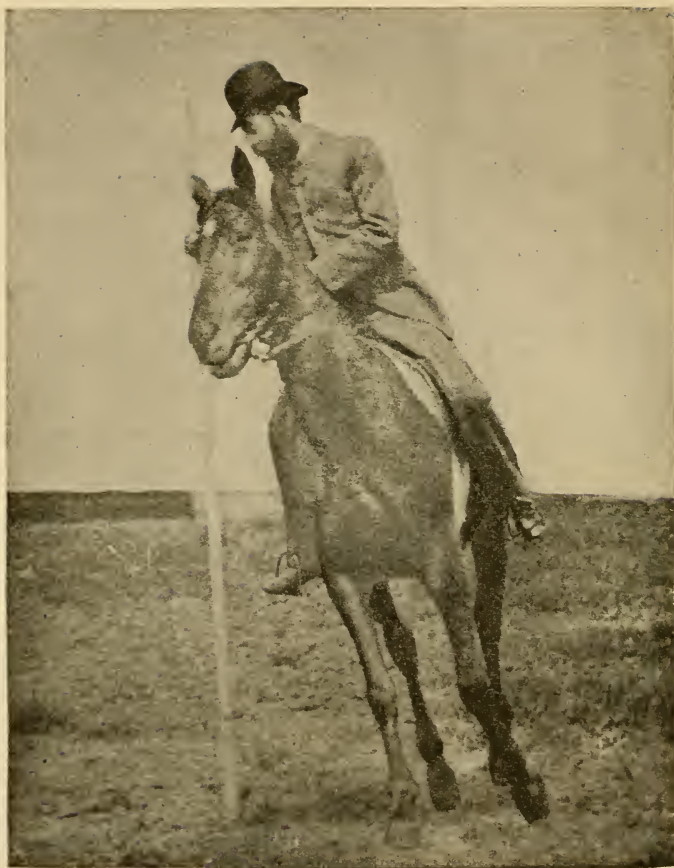
THE GALLOP ABOUT A LANCE.