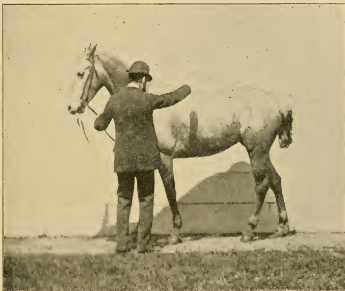
BACKING. THE IMPULSE.

or legs being flexed will take a step to the rear, instead of to the front; this one step having been taken, he will again tap the horse upon the rump, release the tension upon the reins, and let the