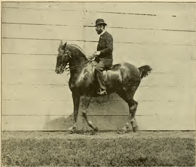
HALF-HALT. FROM THE TROT.

a moment only, when some movement should be demanded, while the legs are flexed, or the horse should be permitted to come to a finished halt and the aids be withdrawn.