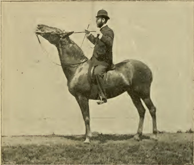
ELEVATION OF THE HEAD, MOUNTED.

knew the fact or not, something of a method was employed before the horse was safe or easy to ride, and it is possible that the horse in self-defence sometimes picks up a proper bearing