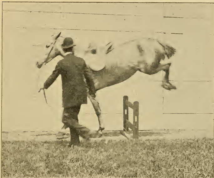
JUMPING IN HAND.

jump to get over. The snaffle-bit only should be used in these early lessons, and the tension upon the reins only sufficient to guide the horse to the obstacle. The man should make no effort to