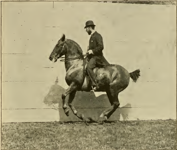
GALLOP CHANGES. FROM RIGHT TO LEFT.

turning from a circle on one hand to a circle on the other hand, taking care that the change is made as the turn to the other hand is demanded; for, in turning abruptly from a circle on one