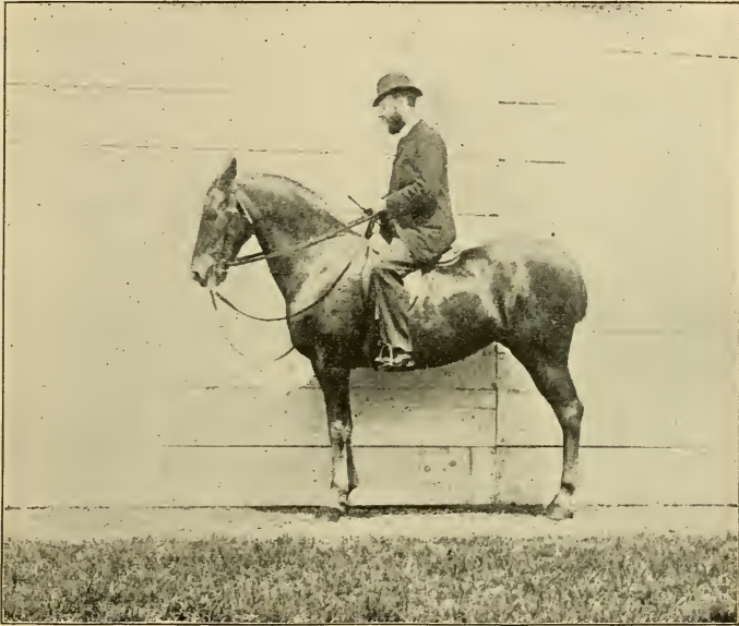
POSITION OF THE HEAD.

over the forces and weights of the extremities of the forehand and of the hind quarters, but he must know how to correct the natural defects of the animal, so that he can readily produce what