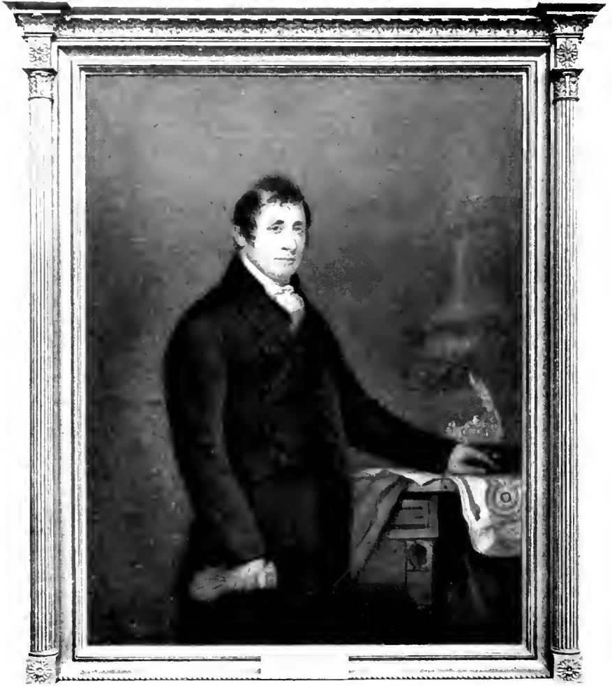
DANIEL D. TOMPKINS