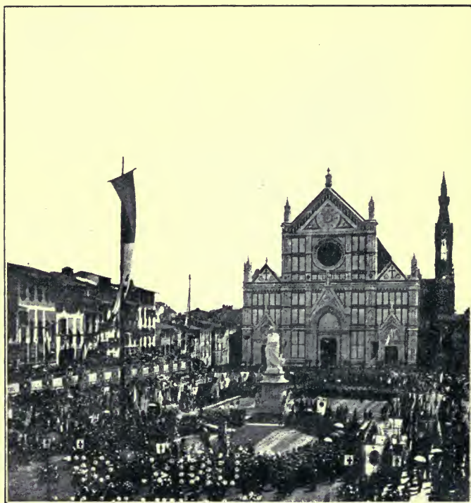
INAUGURATION OF DANTE'S STATUE, FLORENCE, 1865.