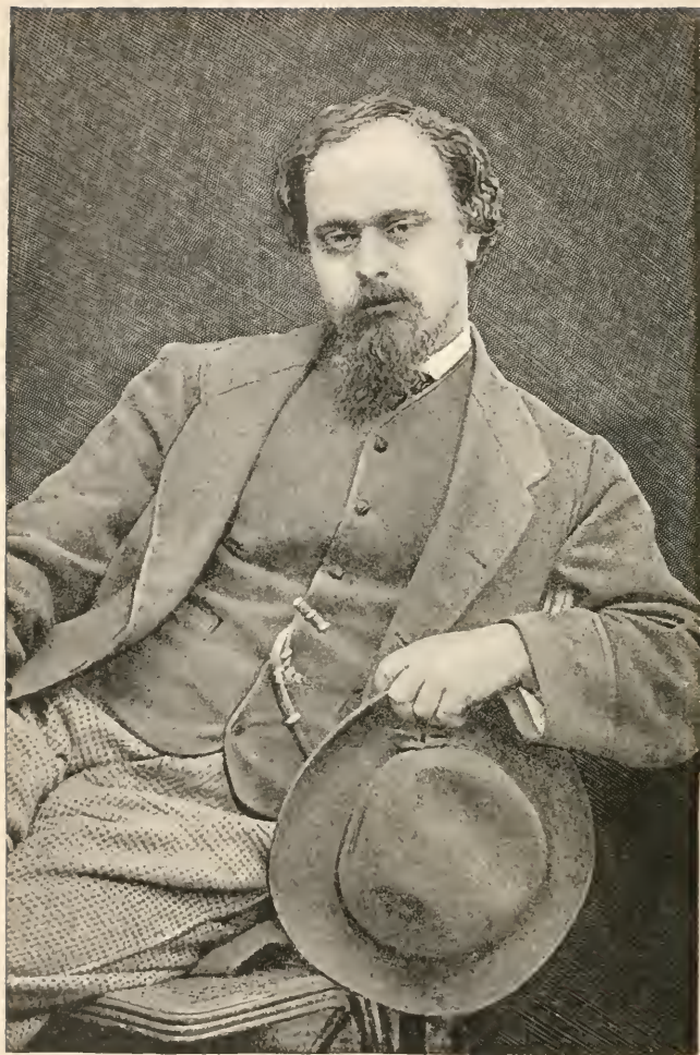
DANTE GABRIEL ROSSETTI