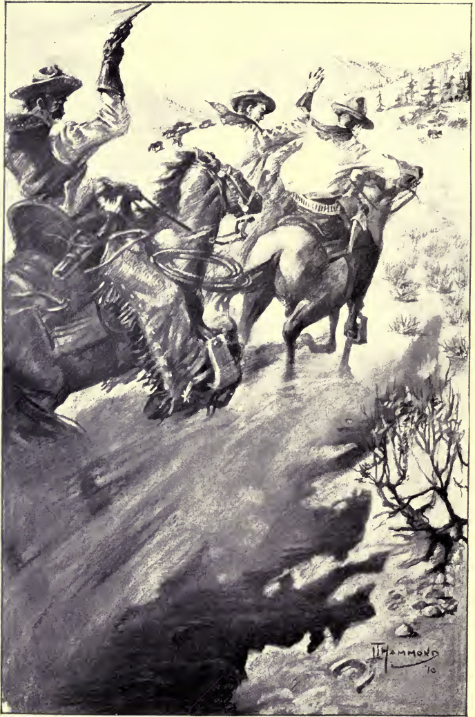
AS DAVE CLUCKED AGAIN, HERO SHOT AHEAD. — Page 121.