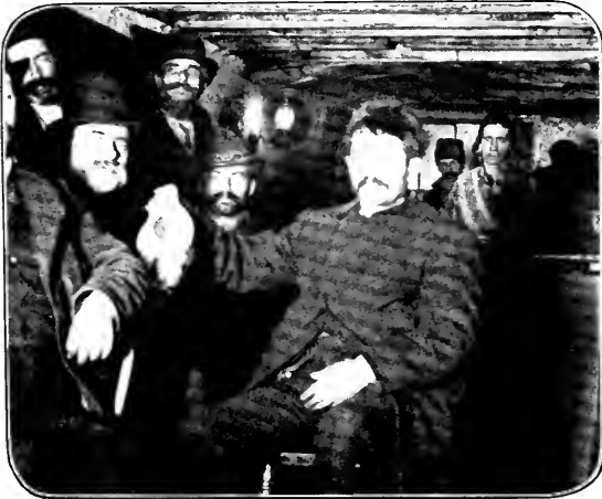
ONE OF RANNEY'S FORMER HAUNTS.