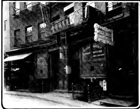
1. THE CHURCH OF SEA AND LAND. 2. MIDNIGHT MISSION, CHINATOWN.