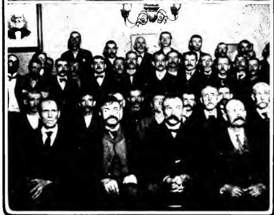
1. READING ROOM, SQUIRREL INN. 2. MEN'S CLUB AT CHURCH OF SEA AND LAND.