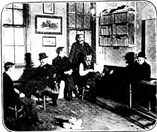
READING-ROOM IN A LODGING-HOUSE.