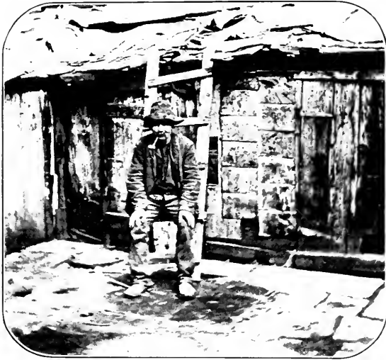
A BACK YARD ON THE POWERY.