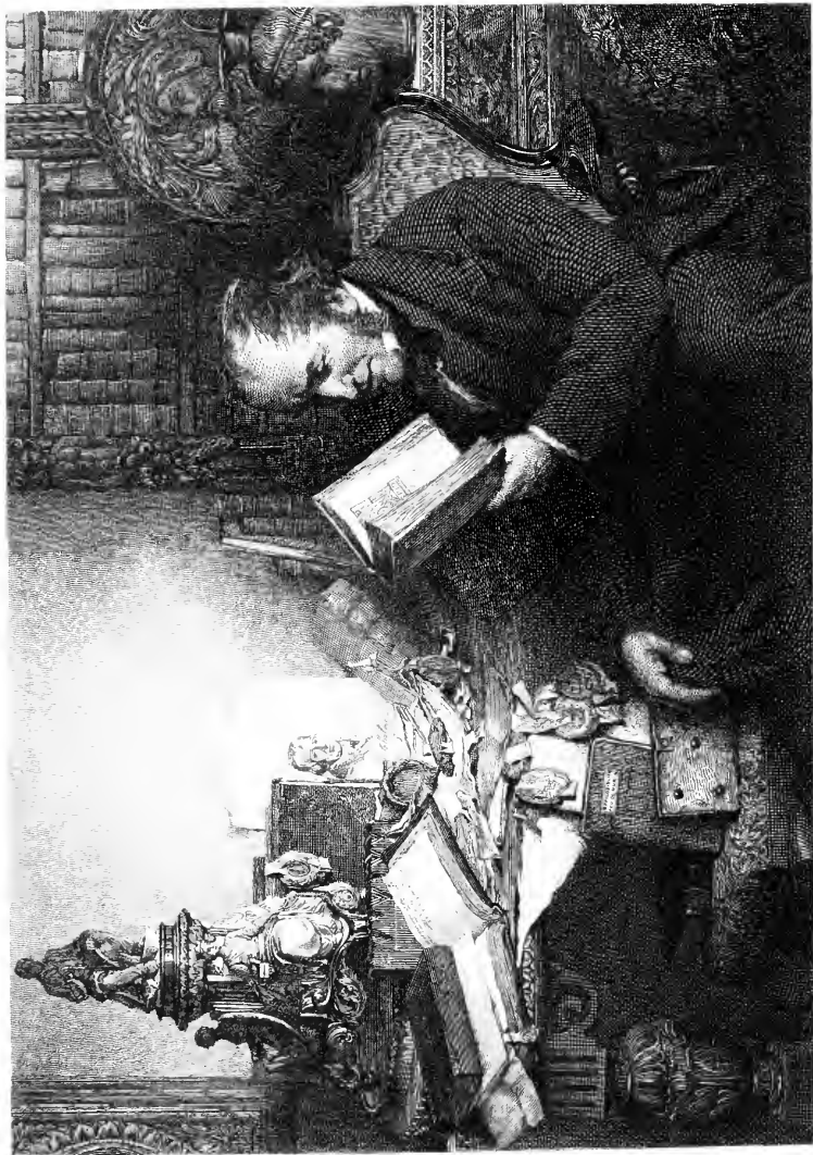
When the great scholar is at his desk, he is at his work.