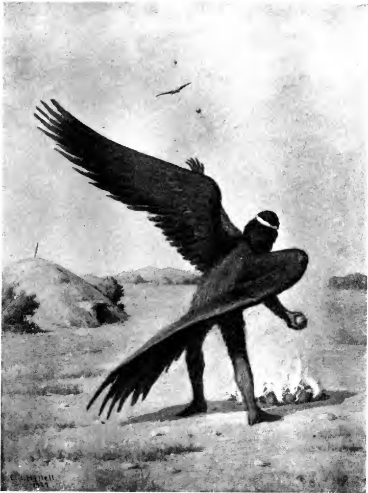
The Giant Ke'-lok hurling hot Rocks at Wek'-wek