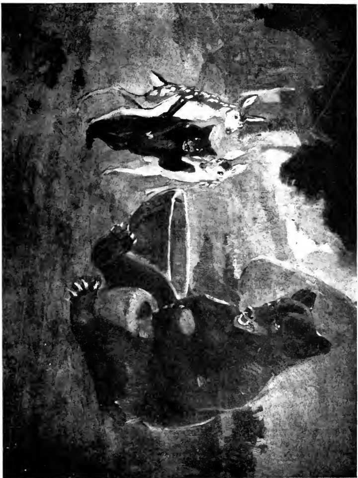
The Fawns asking Mother Bear if they may play with her Baby