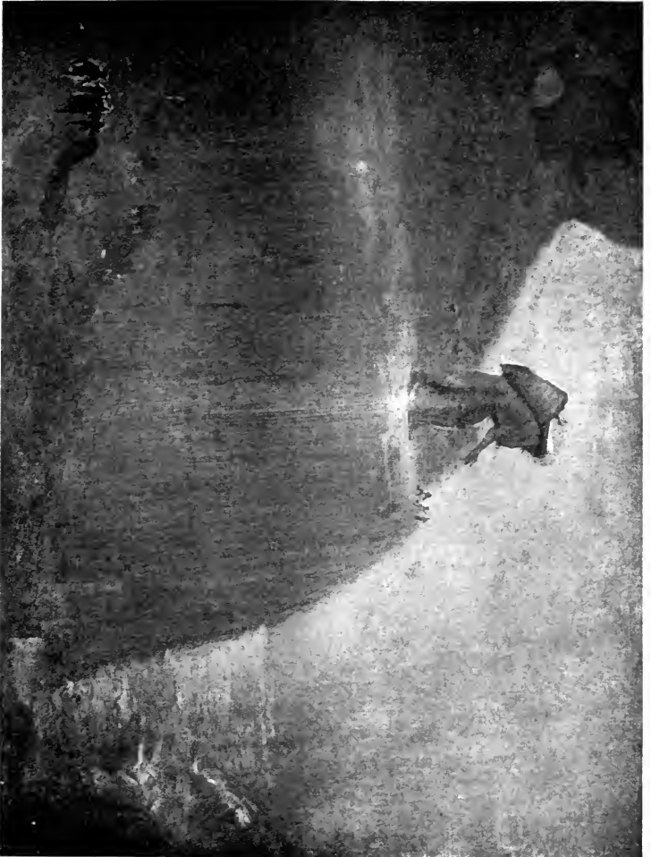
Ch'ua-lu-lu'-che the Rock Giant catching People to eat