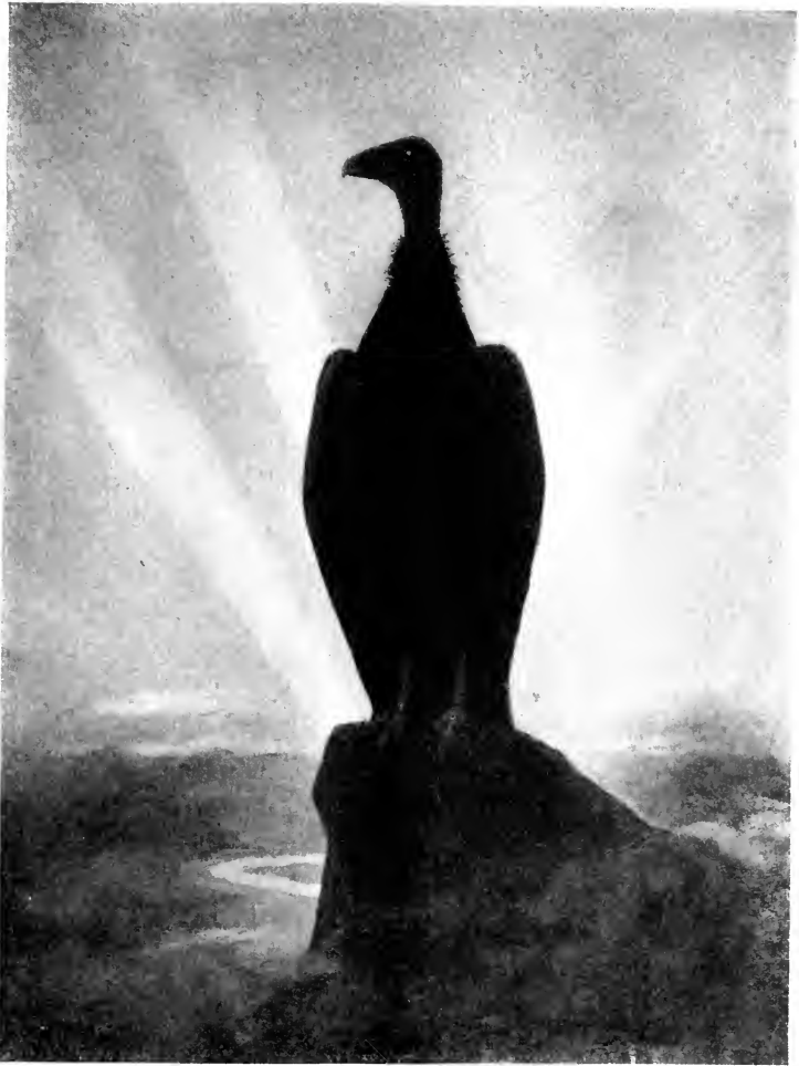
Mol'-luk the Condor looking off over the World from his Rock on Mount Diablo