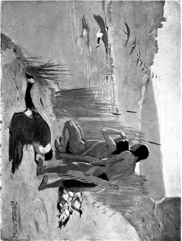
The Orphan Boys killing Ducks and Geese by the River. "For a month they hunted birds and ate them"