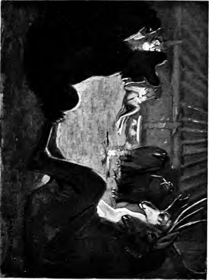
Tol'-le-boo the Mouse playing his Flute and putting the Valley People to sleep so that he can steal the Fire