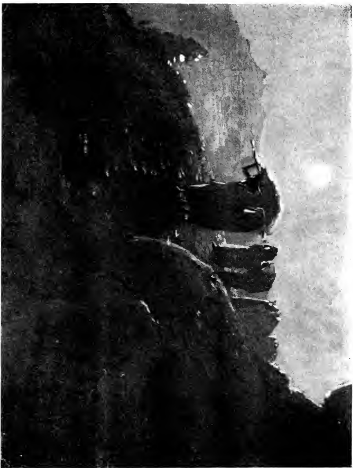
Funeral of Lo'-and , wife of Mek'-avik