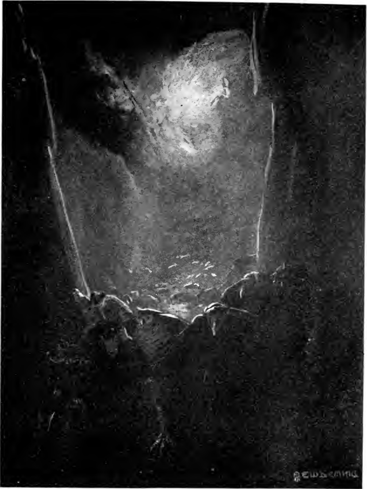
The Valley People shrinking from the Light. " Ah-ha-le stole the Sun and brought it down through the fog and darkness to the Valley People, but they were afraid and turned from it."