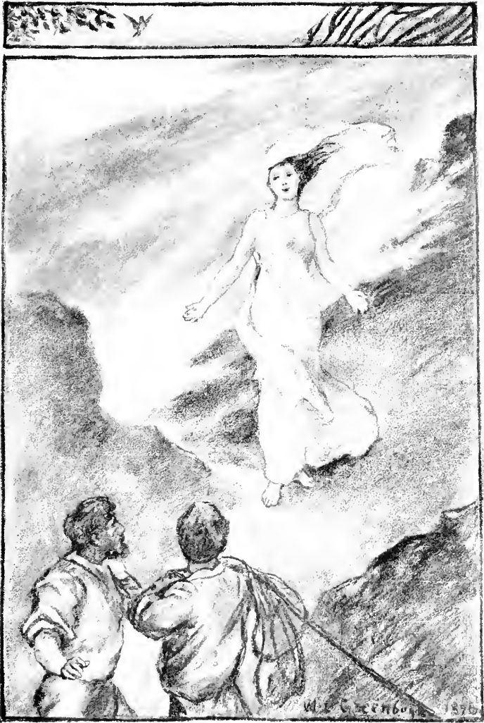
"POURING FORTH HER VOICE IN THAT ENQUIETIE SONG."