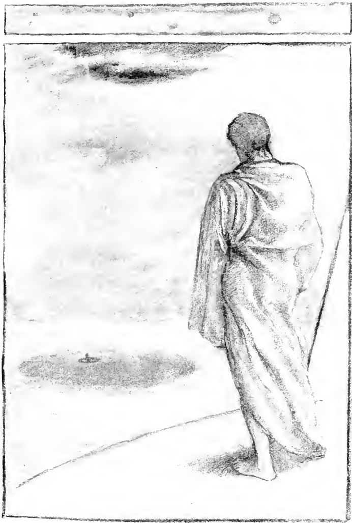
THORWALD DISCOVERS ONE OF THE EARTH-DWELLERS.