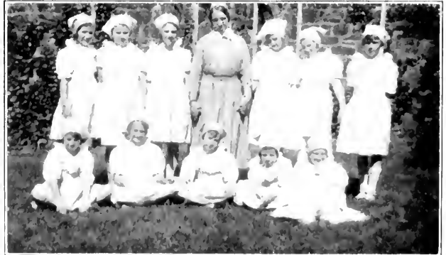
The Music Club of the Lankenau School presents a "Little Dutch Dance."