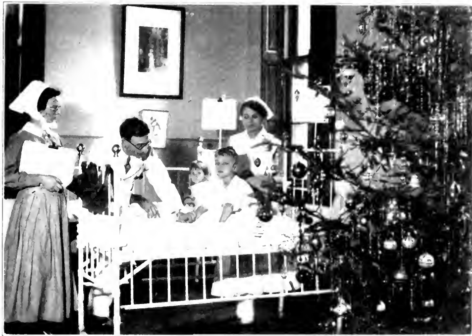
Nursing brings many contacts with patients, doctors, nurses.