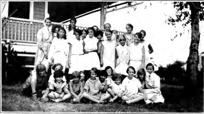
A group of Lankenau Girls with their teachers at the summer cottage, Cape May Point.