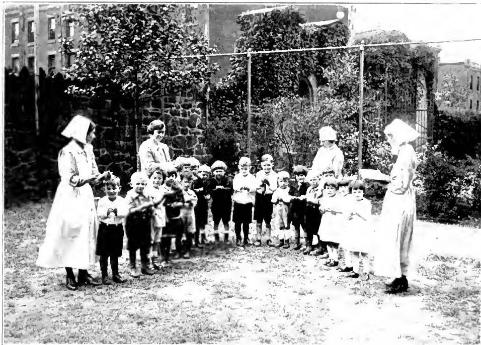
A Kindergarten at Play