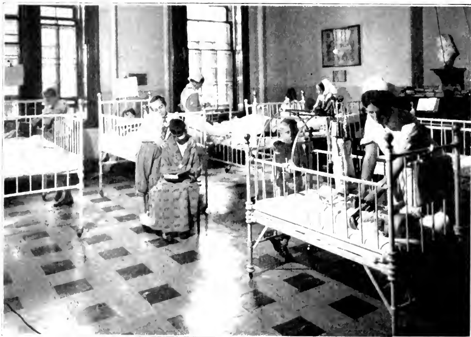
Surgical Ward in Children's Hospital of the Philadelphia Motherhouse