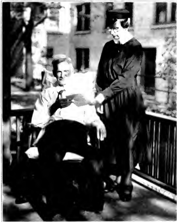
Reading to the Shut-ins