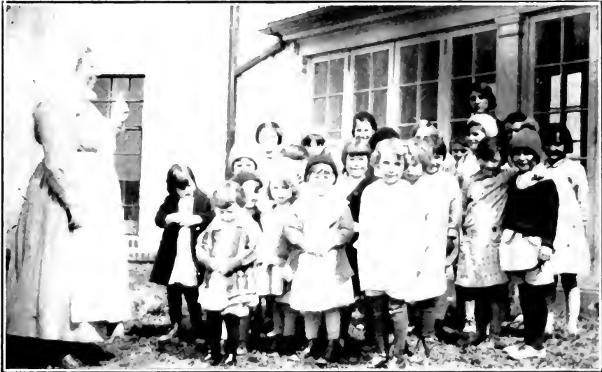
Looking for the Easter Bunny