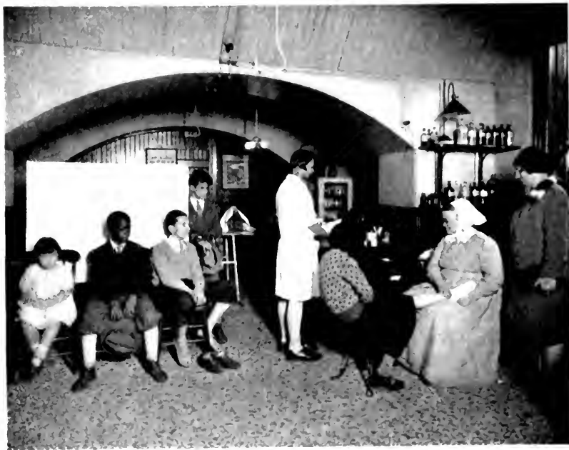
Scene in the Dispensary