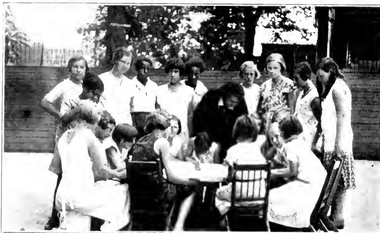
A Quilting Class at the Lutheran Settlement House in Philadelphia