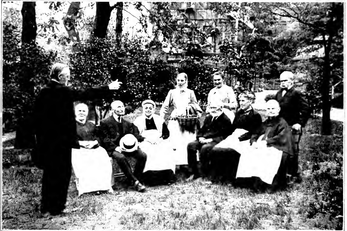
[A Group from the Home for the Aged, Philadelphia Entertaining His Friends