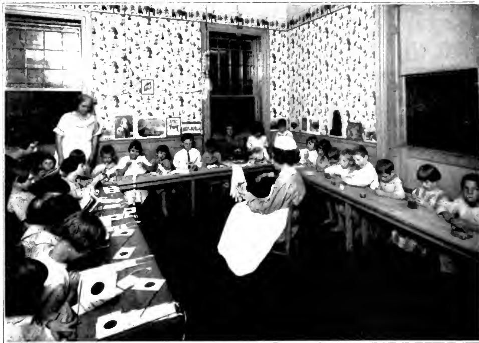
A Kindergarten at Work