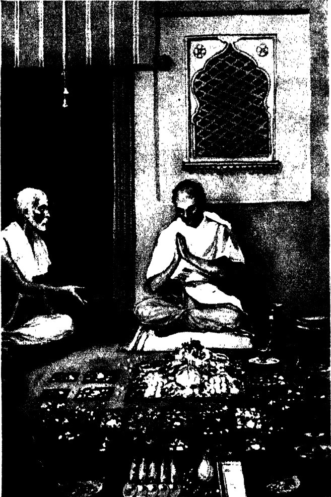
‘GAVE MEMORIAL HONOURS TO HIS DEAD FATHER.’ . . . p. 108