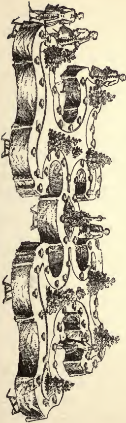
DINING-TABLE OF GILLIERS.

gives a dozen plans of tables of capricious arabesque and rocaille forms, accompanied by minute directions for drawing the figures and sawing them out of deal boards. To make such tables is very easy and simple, and I have no doubt that if some lady would take the trouble to give a grand feast at a table such as the one figured in our cut, she would not regret her elegant initiative.