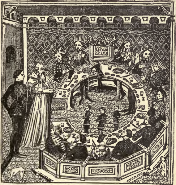
ROUND TABLE OF FOURTEENTH CENTURY.

the service is always inconvenient. What can be more disagreeable than the ordinary modern system of service executed by waiters who approach the diner treacherously