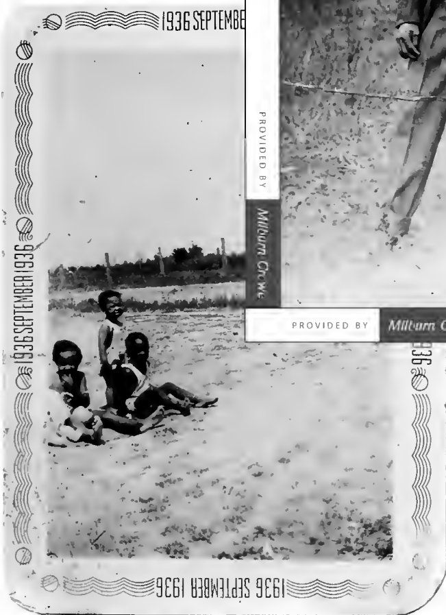
PROVIDED BY Milburn Crowe