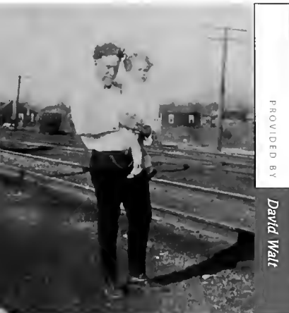
PROVIDED BY David Walt

The rise of the railroad industry was crucial to settling the Delta and emerged as a major theme in the images collected in the Delta Photo Roadshow. Tracks laid on the high ground allowed settlers to enter the once impenetrable bottomland wilderness that thrived in the alluvial soil and swampy heat. Soon, towns such as Cleveland, Boyle, Shaw, and Mound Bayou were built up around the Illinois Central Railroad, which owned much of the land in the Delta, and families made their living operating and managing the trains.