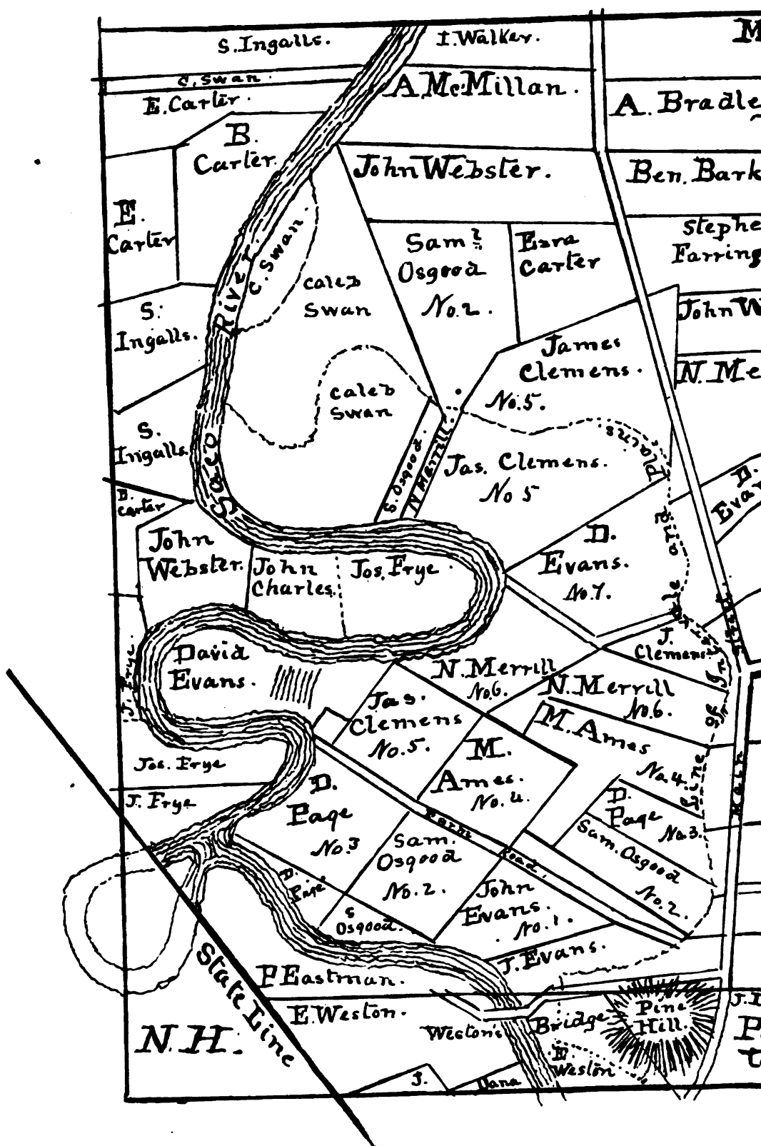
The map, copied from the old town plan, shows the allotment of the original Seven main street was laid out along the steep and high bank which descends from the level "pine p plain where Fryeburg village now stands was a favorite camping ground of the Pequawket southward to the lower end of Lovewell's Pond, which connects with it by a short outlet. The thirty-six miles, paddle up through Lovewell's Pond, and land within two miles of their starting