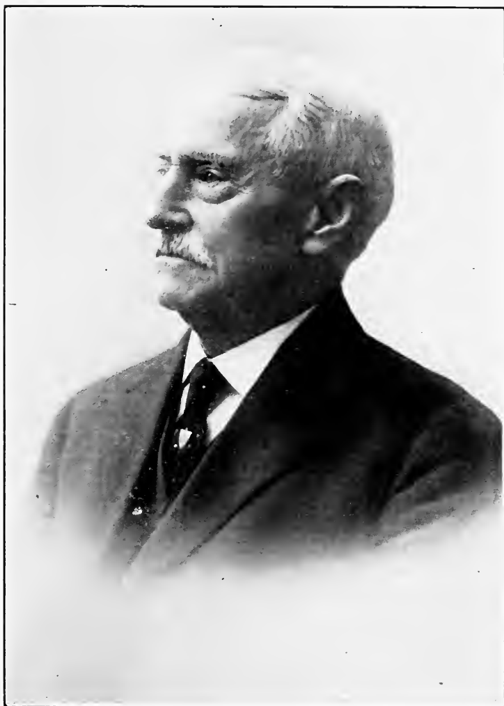
CHARLES TITUS CHURCH