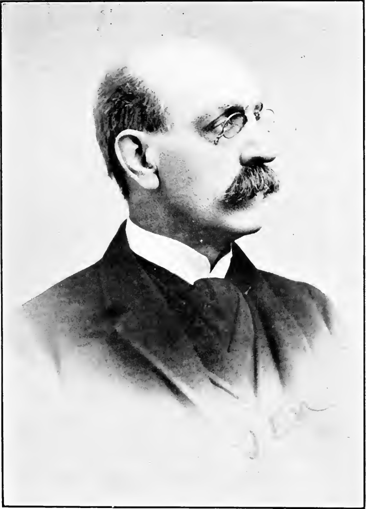
SENATOR LYMAN R. CASEY