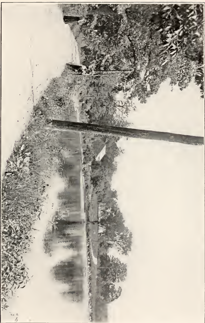
BIRTHPLACE OF DR. JOSEPH WHITE (20) Overlooking Lake Pocatapong, East Hampton, Conn.