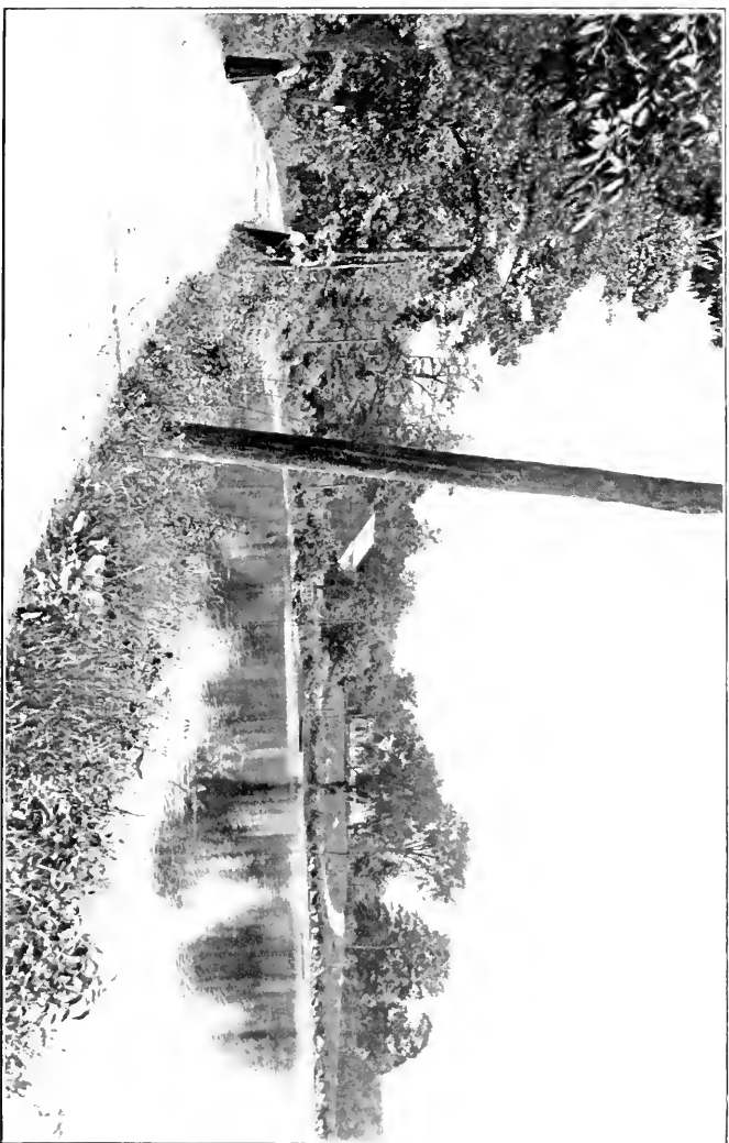
BIRTHPLACE OF DR. JOSEPH WHITE (20) Overlooking Lake Pocatapong, East Hampton, Conn.