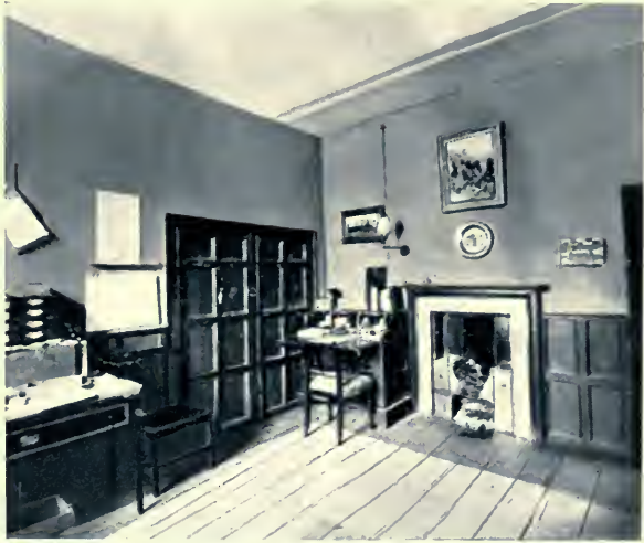
THE OAK-PANELLED ROOM.

THE antique oak-panelling has been overlaid with paint, but is being carefully restored to its original condition. The moulding is identical with that of the recessed-cupboard doors, and is bolted with wood staples in the ancient manner.