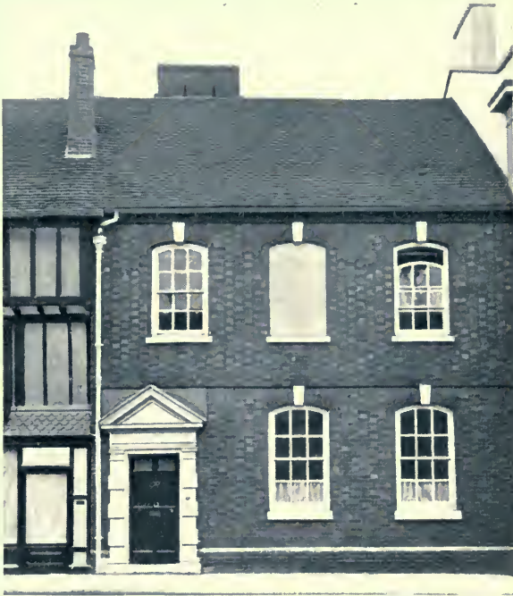
THE MODERNISED FRONTAGE.

THE front of the old house has been modernised, though at no recent date, as may be gathered from the “blind” window on the first floor, significant of the days of “window-tax.”