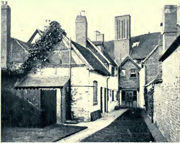
VIEW FROM GARDEN.

ONE of the most curious and striking objects in the SHAKESPEARE HEAD PRESS is the broad, massive chimney. The main shaft runs right through the house, and at the base, into which the Tudor Mantelpiece (p. 7) is fitted, it is more than six feet in thickness. The ornamentation of the part above the roof is unique in Stratford, but the chimneys of the almshouses, adjacent to the Grammar School, are somewhat similar in design.