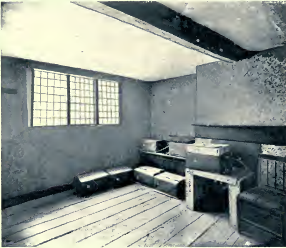
A STORE ROOM.

T HIS old room is used for the storing of paper, printed and unprinted. On the glass panes of the leaded window have been scratched the names of former occupiers. It is a low-roofed room, situated immediately over the old kitchen now used as a composing-room.