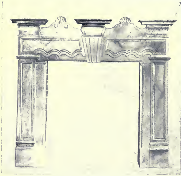
TUDOR MANTELPiece (on the ground floor).

T HE fine Tudor mantelpiece, in the front room on the ground floor, has happily been preserved in its original state uninjured and undisturbed. It dates back beyond Shakespeare's time to the days of Henry VII.