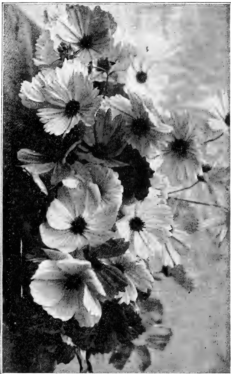
GROUP OF GIANT COSMOS.