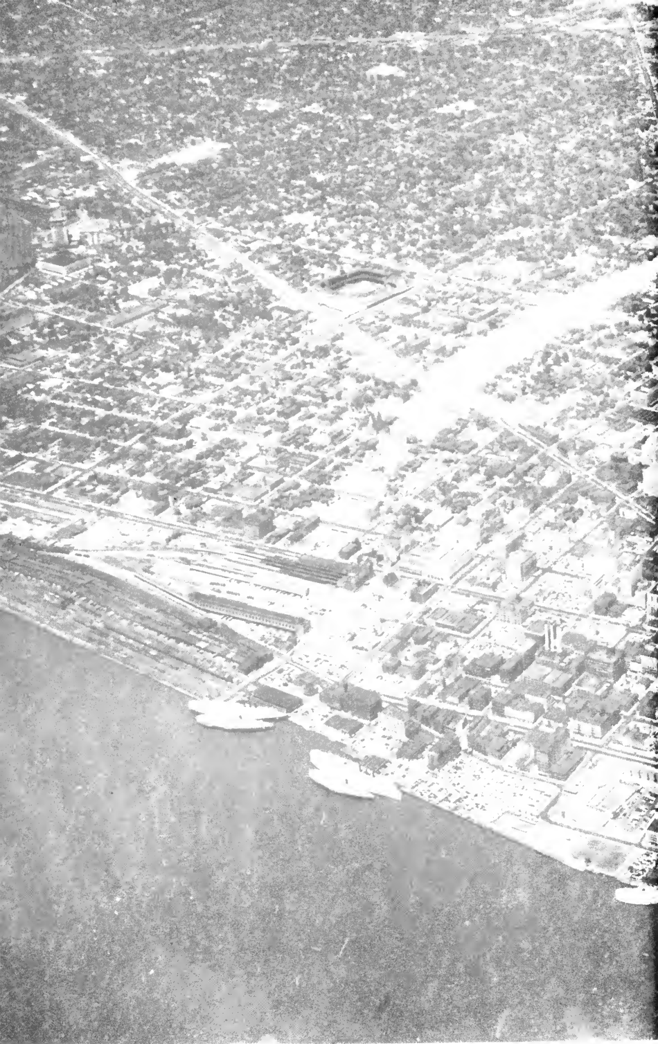
Detroit in 1953—Detroit