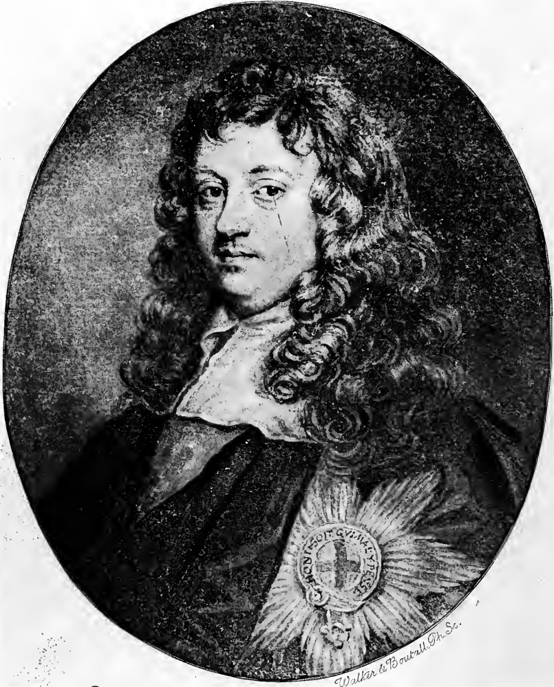
The Earl of Sandwich, K.G. from a drawing in the Pepys collection.