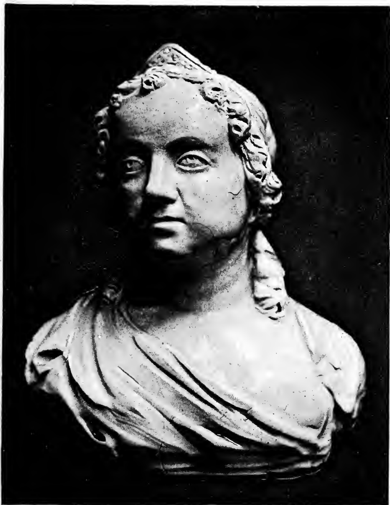
Glazed Stoneware Bust of Mr. Pepys, by John Dwight of Fulham.