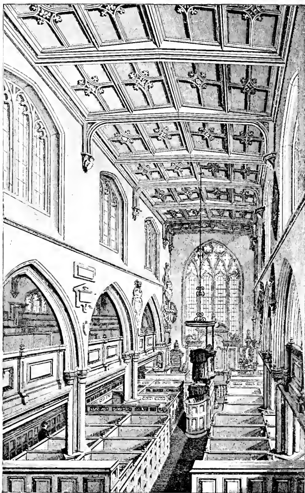
INTERIOR OF ST. OLAVE'S, HART STREET.